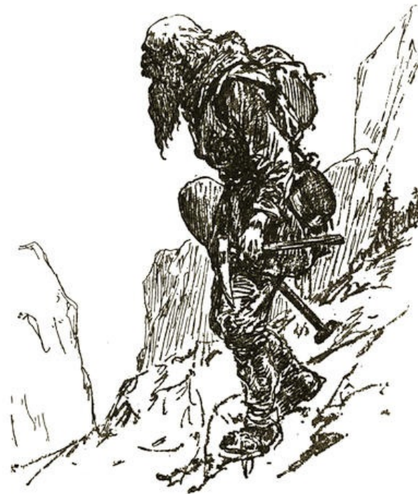
THE RÉ VALLEY SWEDE