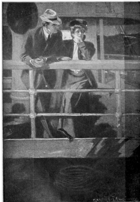
"WHAT I WANT—I TAKE," AND THEN, TURNING, HE KISSED HER SOFTLY, FIERCELY, FULL UPON THE LIPS

Glenister, on the other hand, stood carelessly, beating the men off as they came to him. He laughed gloatingly, deep in his throat, as though the encounter were merely some rough sport. The girl shuddered, for the desperate silence of the attacking men terrified