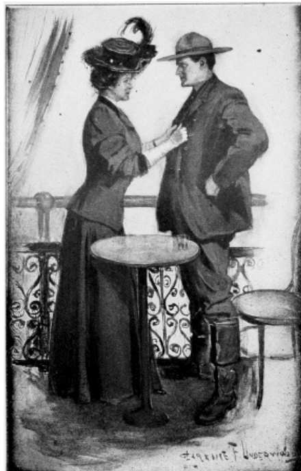
"WELL," SHE SAID. "KISS ME!"

She pulled him towards the light and gazed upward, devouring him hungrily with her great, languorous eyes.