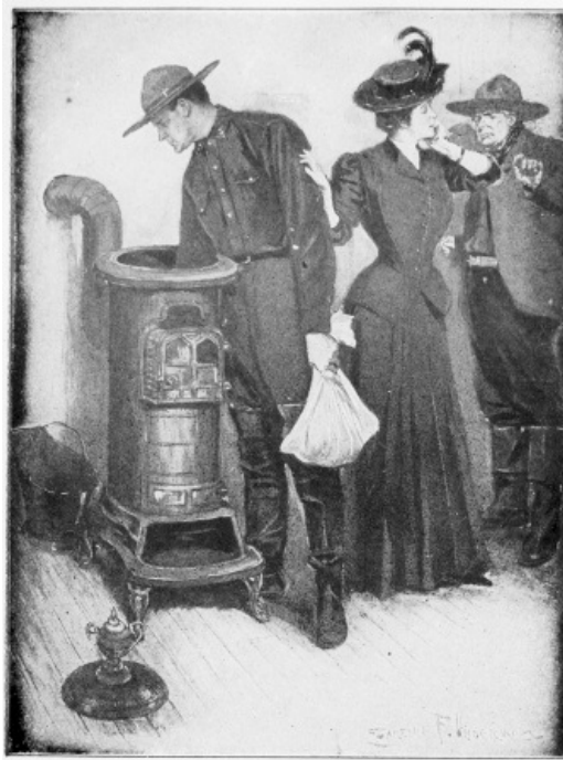
"IN AN INSTANT THE FOUR SACKS WERE DROPPED SOFTLY INTO THE FEATHERY BOTTOM"

neither. 'Stead of our bein' caught in the mountains, I reckon we'll shoot it out here. We should have cached that gold somewhere."