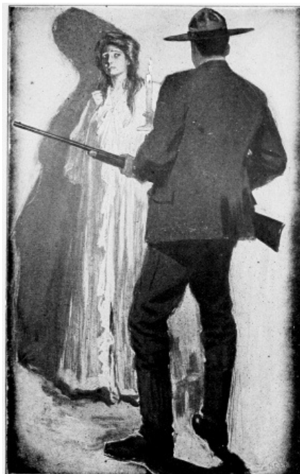
"SHE STEPPED BACK AGAINST THE WALL, HER WONDROUS, DEEP, GRAY EYES WIDE AND TROUBLED"

What would be the temper of this gold-frenzied army if thrown into quarantine within sight of their goal? The impatient hundreds would have to lie packed in their floating prison, submitting to the foul disease. Long they must lie thus, till a month should