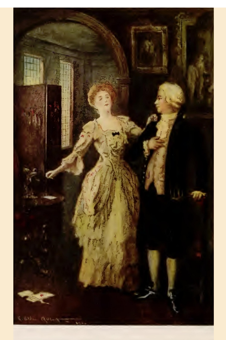
"'Oh, I have said too much,' she cried pitconsly."