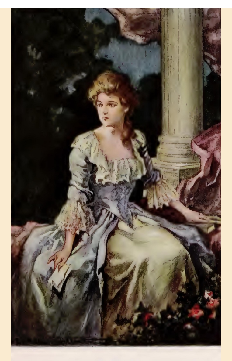
"But there were no tears in her eyes as she spoke the words of Olivia's song."