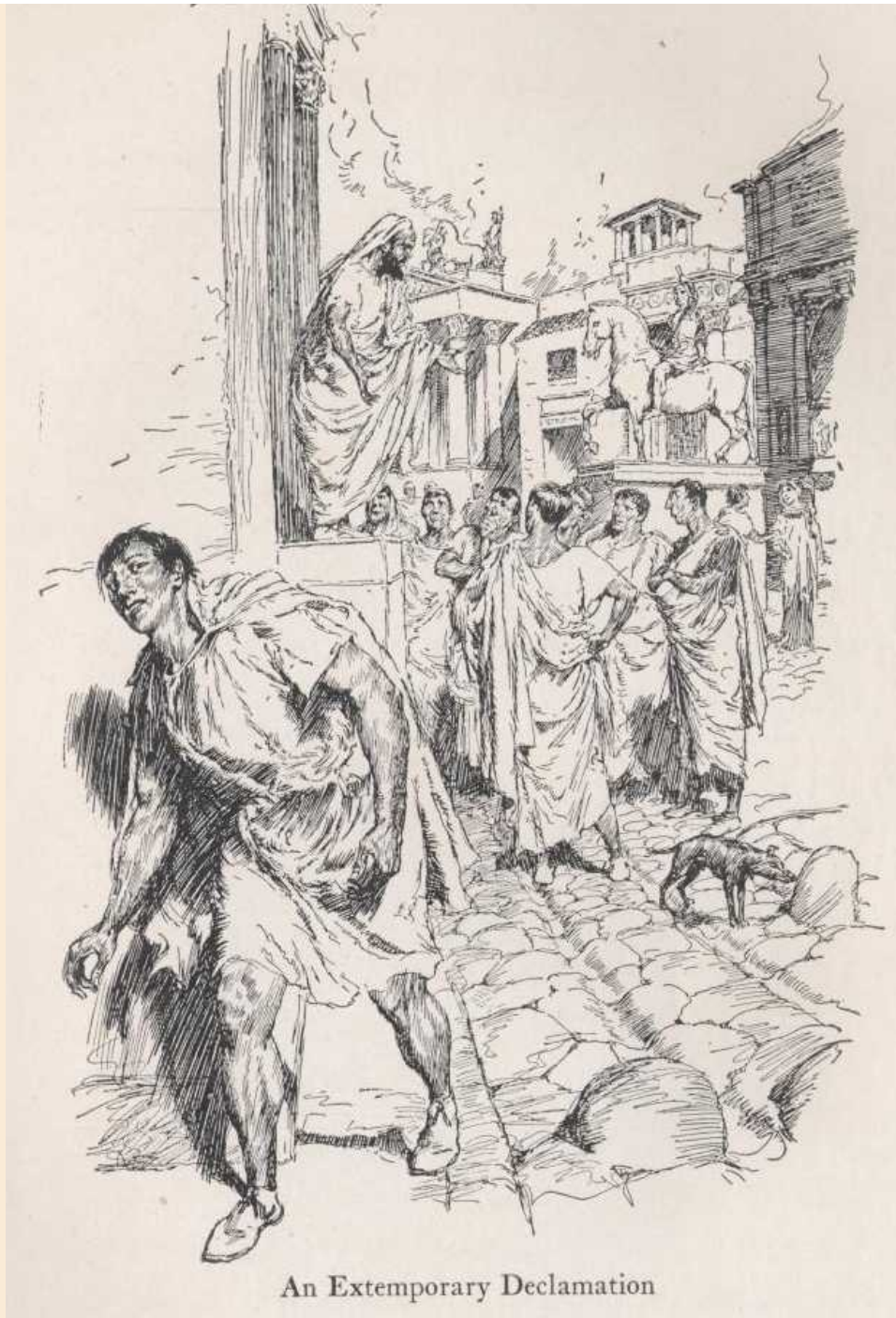
An Extemporary Declamation