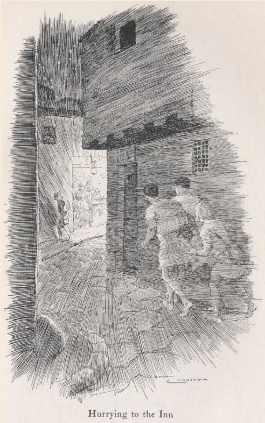
Hurrying to the Inn