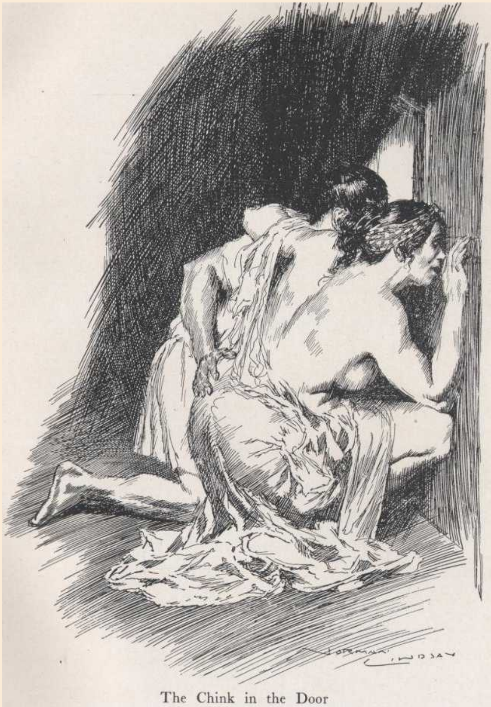
The Chink in the Door

She was still talking when Psyche, who was giggling, came to her side and whispered something in her ear. What it was, I did not catch. "By all means," ejaculated Quartilla, "a brilliant idea! Why shouldn't our pretty little Pannychis lose her maidenhead when the opportunity is so favorable?" A little girl, pretty enough, too, was led in at once; she looked to be not over seven years of age, and she was the same one who had before accompanied Quartilla to our room. Amidst universal applause, and in response to the demands of all, they made ready to perform the nuptial rites. I was completely out of countenance, and insisted that such a modest boy as Giton was entirely unfitted for such a wanton part, and moreover, that the child was not of an age at which she could receive that which a woman must take. "Is that so," Quartilla scoffed, "is she any younger than I was, when I submitted to my first man? Juno, my patroness, curse me if I can remember the time when I ever was a virgin, for I diverted myself with others of my own age, as a child then as the years passed, I played with bigger boys, until at last I reached my present age. I suppose that this explains the origin of the proverb, 'Who carried the calf may carry the bull,' as they say." As I feared that Giton might run greater risk if I were absent, I got up to take part in the ceremony.