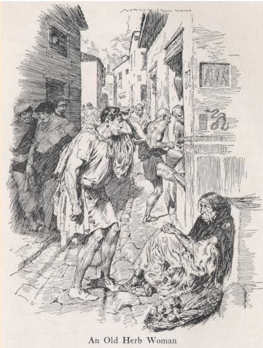
An Old Herb Woman