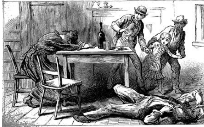
LITTLE MAUD'S ESCAPE FROM HER ABDUCTORS.

Bob hurried along his two companions till they had reached a point some half a mile distant from the place of their imprisonment. Then he thought it best to question the little girl. [Pg 289]