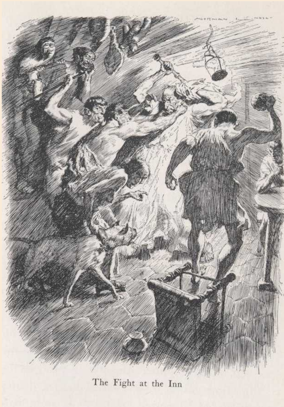
The Fight at the Inn

grabbed a two-tined fork in the pantry and put himself on guard. But worst of all, a blear-eyed old hag, girded round with a filthy apron, and wearing wooden clogs which were not mates, dragged in an immense dog on a chain, and "sicked" him upon Eumolpus, but he beat off all attacks with his candlestick.