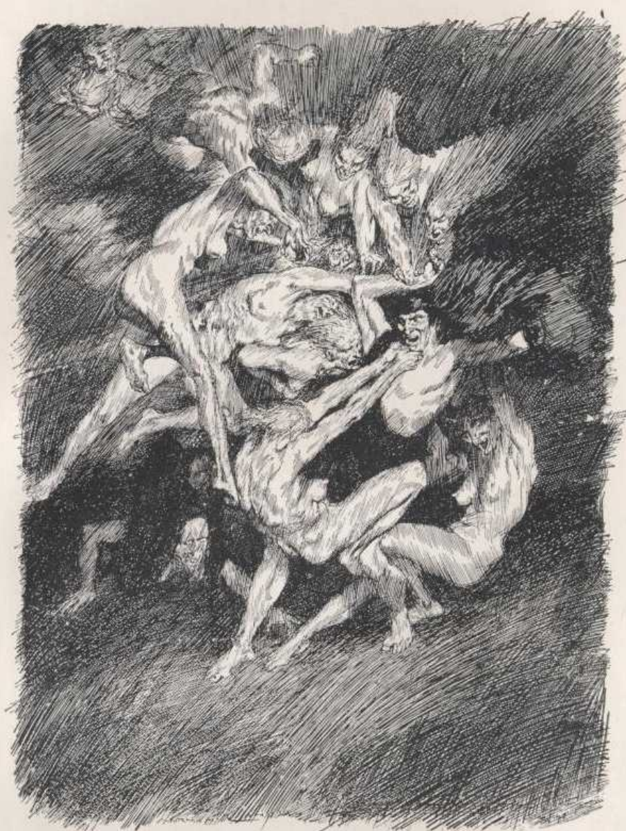
The Witches ( page 138 )