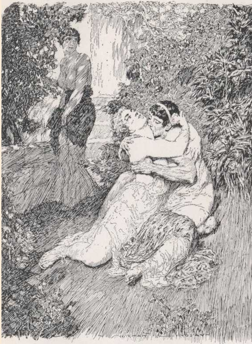
Circe and Eucolpius