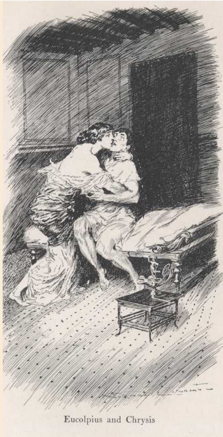
Eucolpius and Chrysis