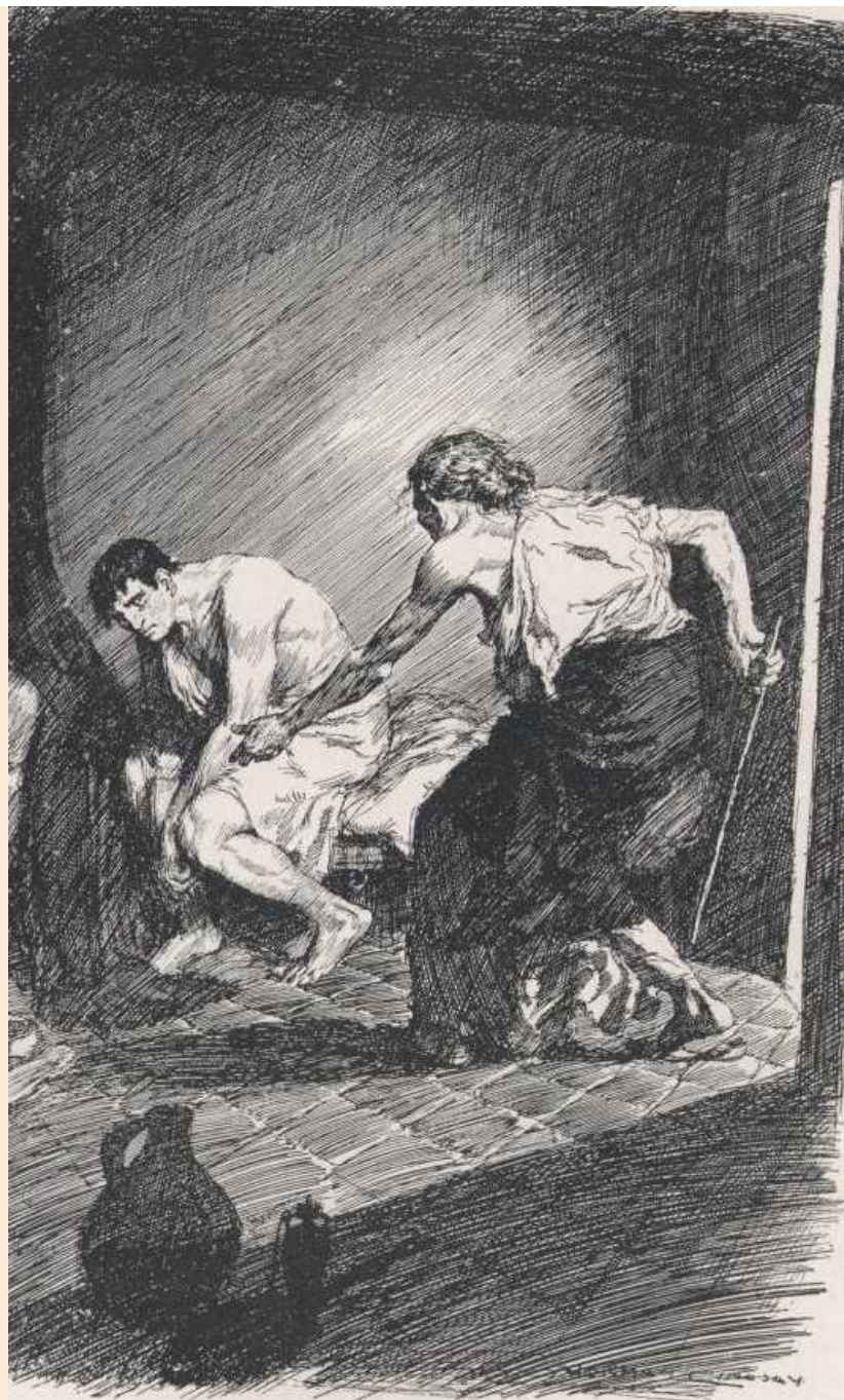
The Priestess' Revenge