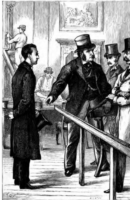
FATHER BARHAM. Click to ENLARGE

Father Barham stood humbly with his hat off. He was a man of infinite pluck; but outward humility—at any rate at the commencement of an enterprise,—was the rule of his life. "I am the Rev. Mr. Barham," said the visitor. "I am the priest of Beccles in Suffolk. I believe I am speaking to Mr. Melmotte."