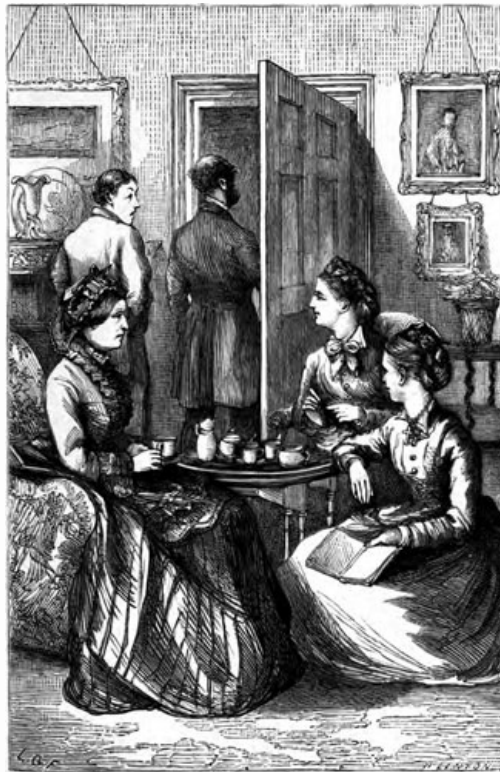
THEN THE SQUIRE LED THE WAY OUT OF THE ROOM, AND DOLLY FOLLOWED.

"You'd better come with me into the study," said the father. "We needn't disturb your mother and sisters about business." Then the squire led the way out of the room, and Dolly followed, making a woful grimace at his sisters. The three ladies sat over their tea for about half-an-hour, waiting,—not the result of the conference, for with that they did not suppose that they would be made acquainted,—but whatever signs of good or evil might be collected from the manner and appearance of the squire when he should return to them. Dolly they did not expect to see again,—probably for a month. He and the squire never did come together without quarrelling, and careless as was the young man in every other respect, he had hitherto been obdurate as to his own rights in any dealings which he had with his father. At the end of the half hour Mr. Longestaffe returned to the drawing-room, and at once pronounced the doom of the family. "My dear," he said, "we shall not return from Caversham to London this year." He struggled hard to maintain a grand dignified tranquillity as he spoke, but his voice quivered with emotion.