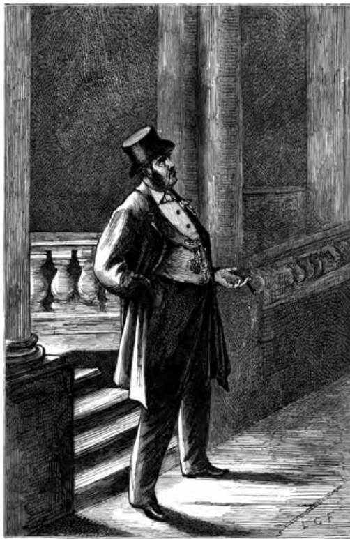
MR. MELMOTTE SPECULATES. Click to ENLARGE