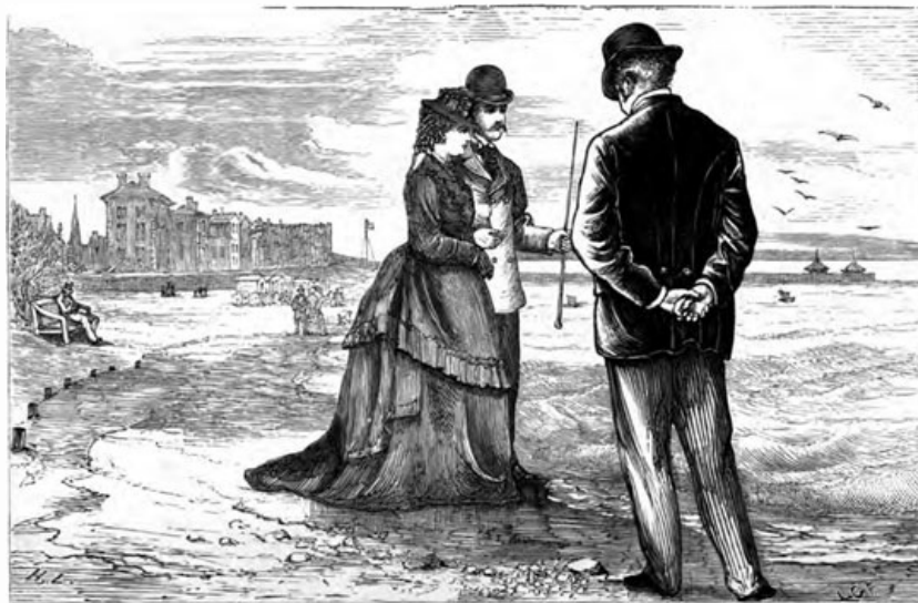
THE SANDS AT LOWESTOFT.

He certainly had been foolish to bring her to Lowestoft, and the close neighbourhood of Carbury Manor;—and now he felt his folly. As soon as he saw Roger Carbury he blushed up to his forehead, and then leaving Mrs. Hurtle's arm he came forward, and shook hands with his friend. "It is Mrs. Hurtle," he said, "I must introduce you," and the introduction was made. Roger took off his hat and bowed, but he did so with the coldest ceremony. Mrs. Hurtle, who was quick enough at gathering the minds of people from their looks, was just as cold in her acknowledgment of the courtesy. In former days she had heard much of Roger Carbury, and surmised that he was no friend to her. "I did not know that you were thinking of coming to Lowestoft," said Roger in a voice that was needlessly severe. But his mind at the present moment was severe, and he could not hide his mind.