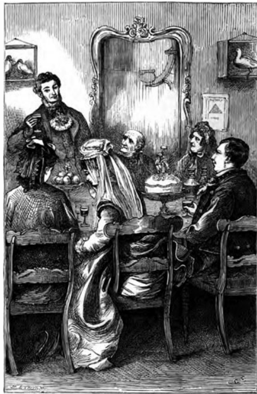
THE HAPPY BRIDEGROOM. Click to ENLARGE

In the afternoon John took his bride to Lowestoft, and brought her back to all the glories of his own house on the following day. His honeymoon was short, but its influence on Ruby was beneficent. When she was alone with the man, knowing that he was her husband, and thinking something of all that he had done to win her to be his wife, she did learn to respect him. "Now, Ruby, give a fellow a buss,—as though you meant it," he said, when the first fitting occasion presented itself.