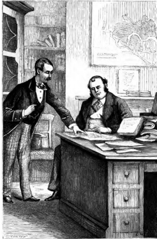
THEN MR. FISKIER BEGAN HIS ACCOUNT.

Railway, and exhibited considerable skill by telling it all in comparatively few words. And yet he was gorgeous and florid. In two minutes he had displayed his programme, his maps, and his pictures before Mr. Melmotte's eyes, taking care that Mr. Melmotte should see how often the names of Fiskier, Montague, and Montague, reappeared upon them. As Mr. Melmotte read the documents, Fiskier from time to time put in a word. But the words had no reference at all to the future profits of the railway, or to the benefit which such means of communication would confer upon the world at large; but applied solely to the appetite for such stock as theirs, which might certainly be produced in the speculating world by a proper manipulation of the affairs.