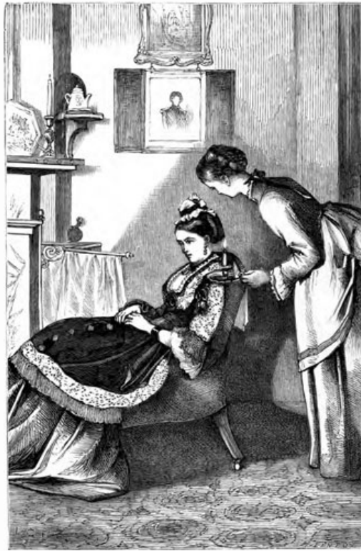
LADY CARBURY ALLOWED HERSELF TO BE KISSED.

else. I have no secret from you now. Good night, mamma," she said, coming up to her mother and kissing her. "Do be kind to me; and pray,—pray,—do believe me." Lady Carbury then allowed herself to be kissed, and allowed her daughter to leave the room.