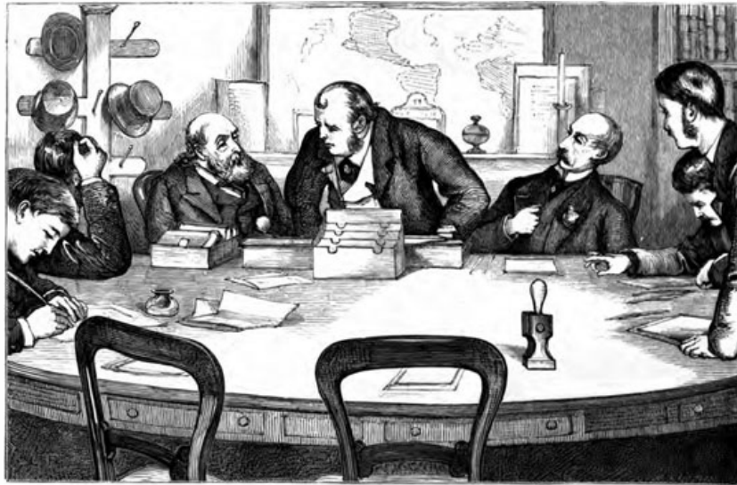
THE BOARD-ROOM. Click to ENLARGE

It was understood that Mr. Melmotte was to make a statement. Lord Nidderdale and Sir Felix had conceived that this was to be done as it were out of the great man's own heart, of his own wish, so that something of the condition of the company might be made known to the directors of the company. But this was not perhaps exactly the truth. Paul Montague had insisted on giving vent to certain doubts at the last meeting but one, and, having made himself very disagreeable indeed, had forced this trouble on the great chairman. On the intermediate Friday the chairman had made himself very unpleasant to Paul, and this had seemed to be an effort on his part to frighten the inimical director out of his opposition, so that the promise of a statement need not be fulfilled. What nuisance can be so great to a man busied with immense affairs, as to have to explain,—or to attempt to explain,—small details to men incapable of understanding them? But Montague had stood to his guns. He had not intended, he said, to dispute the commercial success of the company. But he felt very strongly, and he thought that his brother directors should feel as strongly, that it was necessary that they should know more than they did know. Lord Alfred had declared that he did not in the least agree with his brother director. "If anybody don't understand, it's his own fault," said Mr. Cohenlupe. But Paul would not give way, and it was understood that Mr. Melmotte would make a statement.