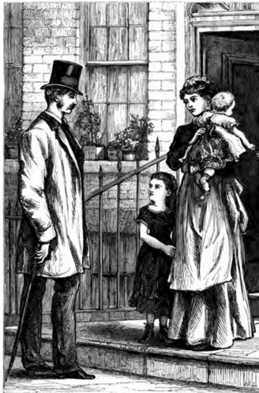
THE DOOR WAS OPENED FOR HIM BY RUBY.

The door was opened for him by Ruby, who by no means greeted him with a happy countenance. It was the second morning after the night of her imprisonment; and nothing had occurred to alleviate her woe. At this very moment her lover should have been in Liverpool, but he was, in fact, abed in Welbeck Street. "Yes, sir; she's at home," said Ruby, with a baby in her arms and a little child hanging on to her dress. "Don't pull so, Sally. Please, sir, is Sir Felix still in London?" Ruby had written to Sir Felix the very night of her imprisonment, but had not as yet received any reply. Paul, whose mind was altogether intent on his own troubles, declared that at present he knew nothing about Sir Felix, and was then shown into Mrs. Hurtle's room.