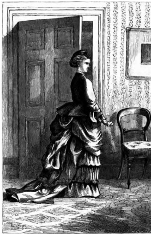
SHE MARCHED MAJESTICALLY OUT OF THE ROOM.