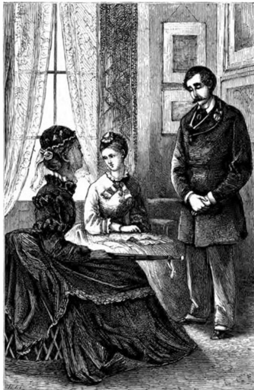
SIR DAMASK SOLVING THE DIFFICULTY.

"How'd you do, Miss Longestaffe? She doesn't know them." And Sir Damask, folding his hands together, raising his eyebrows, and standing on the rug, looked as though he had solved the whole difficulty.