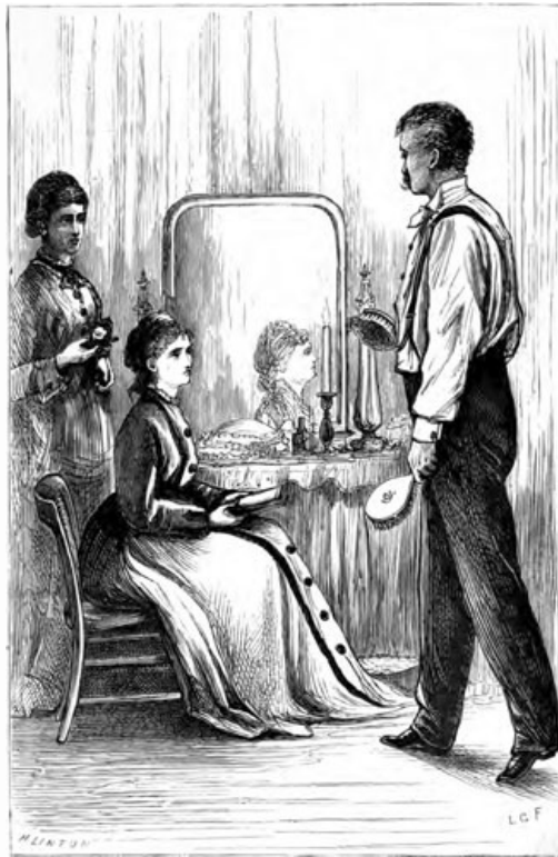
"HAVE YOU HEARD WHAT'S UP, JU?" Click to ENLARGE