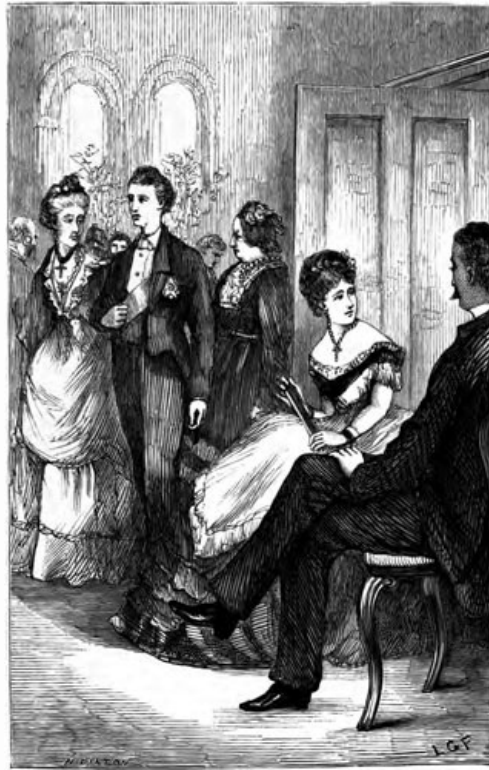
THE DUCHESS FOLLOWED WITH THE MALE VICTIM.

secret from the host himself till the Prince was gone. Melmotte would have desired to pour out that glass of wine with his own hands, to solace his tongue by Royal Highnesses, and would probably have been troublesome and disagreeable. Miles Grendall had understood all this and had managed the affair very well. "Bless my soul;—his Royal Highness come and gone!" exclaimed Melmotte. "You and my father were so fast at your whist that it was impossible to get you away," said Miles. Melmotte was not a fool, and understood it all;—understood not only that it had been thought better that he should not speak to the Prince, but also that it might be better that it should be so. He could not have everything at once. Miles Grendall was very useful to him, and he would not quarrel with Miles, at any rate as yet.