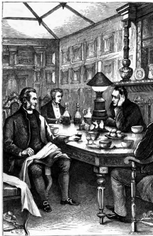
THE BISHOP THINKS THAT THE PRIEST'S ANALOGY IS NOT CORRECT.