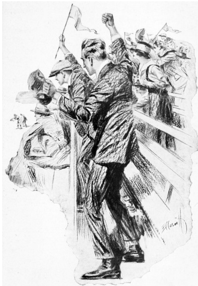
Every Other Medfield Adherent Made a Joyful Noise