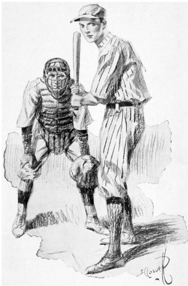
His Conviction that he Could Hit that Ball Was Still Strong

But even yet he was confident. With two strikes against him he still felt certain of getting that hit. It surely looked as if Marks had him in a hole, but Wayne somehow knew that he hadn't. Followed then two wide ones, just outside the plate, and Wayne, expecting them, made no offer. He knew that Marks was tempting him to bite at them and resolutely held back. And then came the fifth delivery.