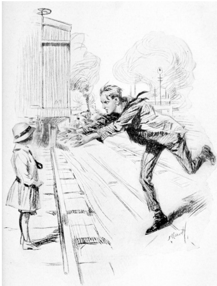
Wayne's Cry Was Uttered Involuntarily as he Leaped Forward