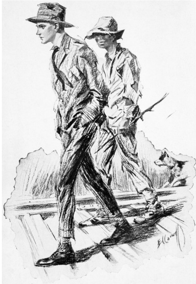
The White Boy, the Black Boy, and the Yellow Dog