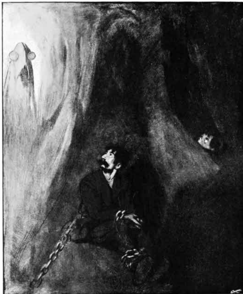
“There the thing was, looking at us”

At the time my mind was taken up by the mad impossibility of the creature. I suppose he also was amazed, and with more reason, perhaps, for amazement than we. Only, confound him! he did not show it. We did at least know what had brought about this meeting of incompatible creatures. But conceive how it would seem to decent Londoners, for example, to come upon a couple of living things, as big as men and absolutely unlike any other earthly animals, careering about among the sheep in Hyde Park! It must have taken him like that. [138]