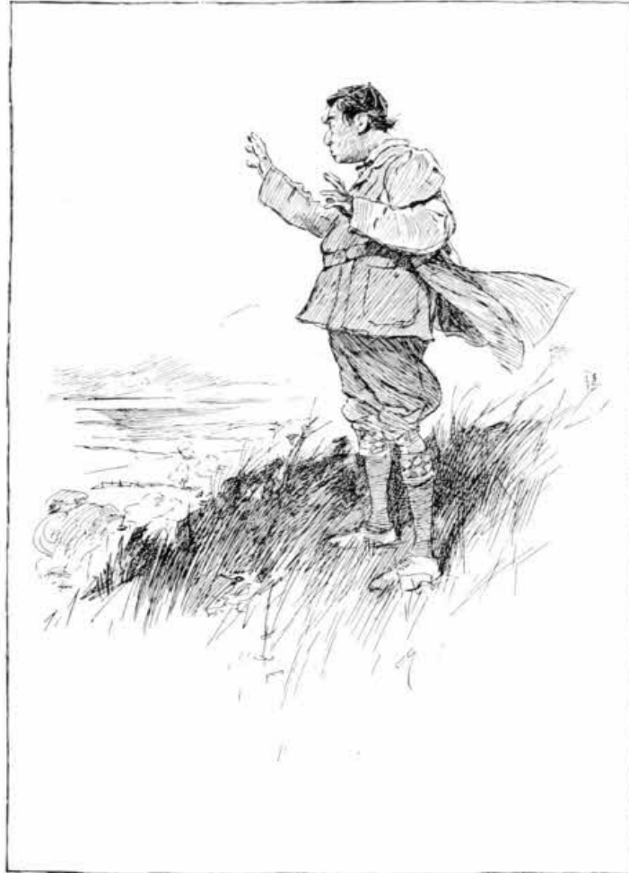
“He gesticulated with his hands and arms”

He was a short, round-bodied, thin-legged little man, with a jerky quality in his motions; he had seen fit to clothe his extraordinary mind in a cricket cap, an overcoat, and cycling knickerbockers and stockings. Why he did so I do not know, for he never cycled and he never played cricket. It was a fortuitous concurrence of garments, arising I know not how. He gesticulated with his hands and arms, and jerked his head about and buzzed . He buzzed like something electric. You never heard such buzzing. And ever and again he cleared his throat with a most extraordinary noise.