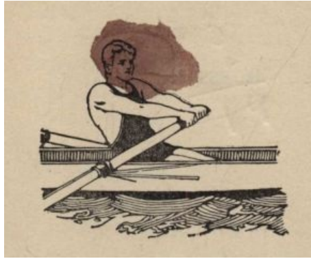
Title page picture

"Rex Kingdon of Ridgewood High," "Rex Kingdon in the the North Woods," "Rex Kingdon at Walcott Hall," "Rex Kingdon Behind the Bat," etc.