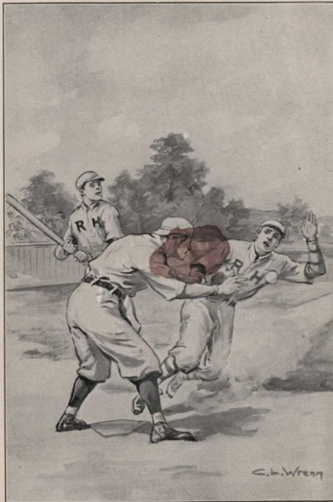
To the amazement of everybody, he was trying to steal home. —Page 257.

To the amazement of everybody, he was trying to steal home.—Page 257.