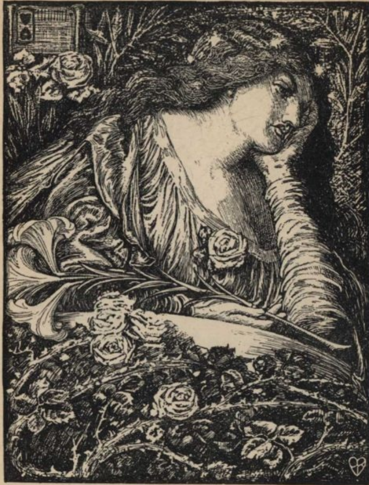
"The blessed Damozel leaned out."