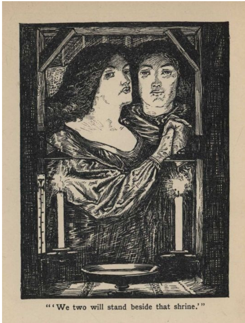
"We two will stand beside that shrine."