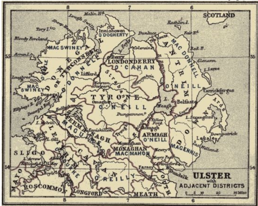
London: Longmans & Co.