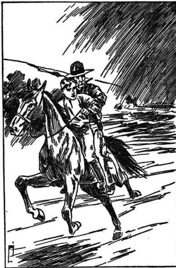
Firewater, balky no longer, gave a mad leap forward. Behind them roared the oncoming flood.