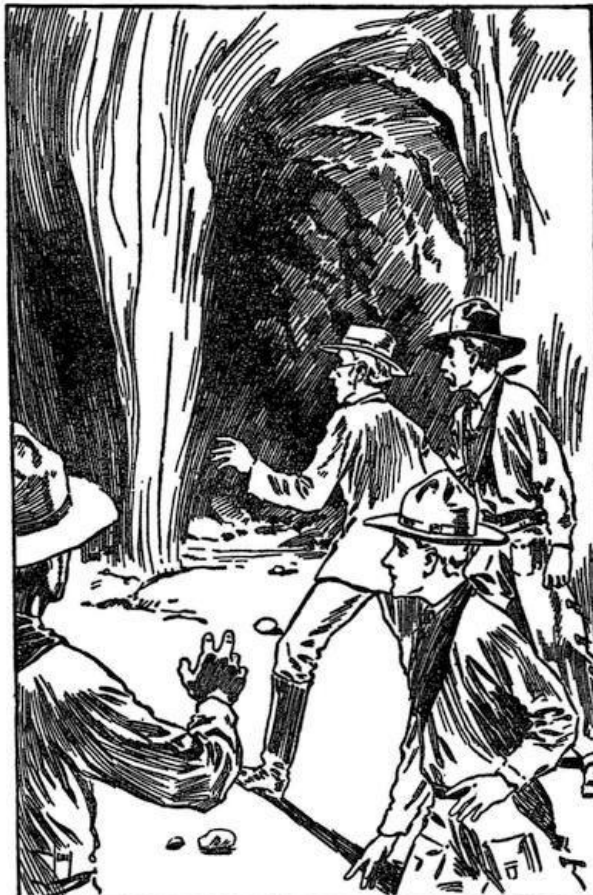
In the midst of a rock chamber, there arose a great flame of an almost white hue.

"We are approaching the subterranean fires," said the professor, "in all probability some titanic flame of natural gas. By the roaring sound I hear, I believe that to be a correct statement of the facts."