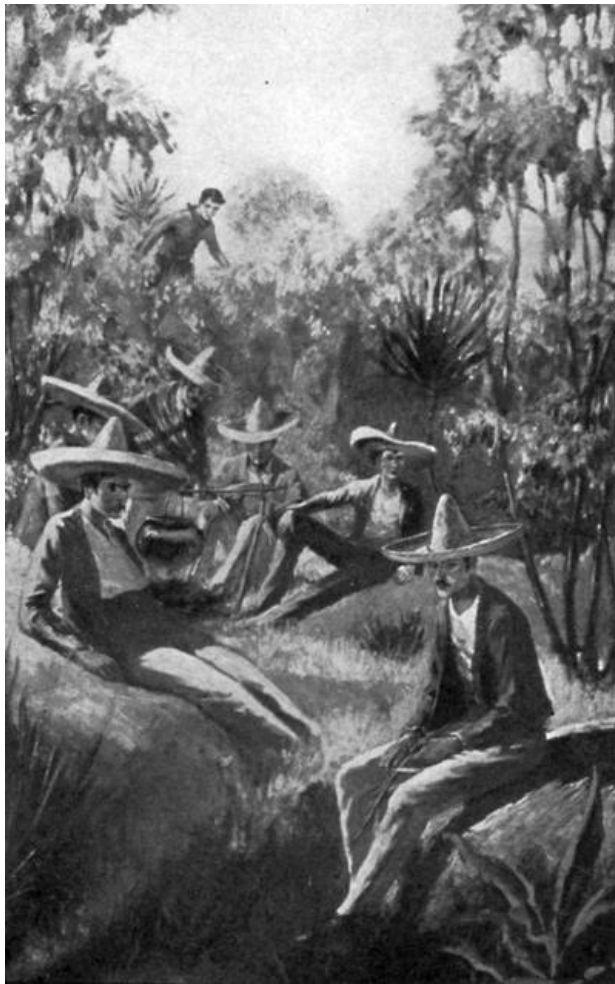
Around a smoldering fire lay several men. (Page 28 ) ( The Border Boys With the Mexican Rangers )