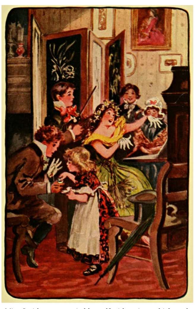
Miss Smith accompanied herself with a vigor which made the old desk rattle. Page 135.

Daisy was already weeping, Bess like a devoted servant mingled her tears with those of her mistress, and Nan denounced the entire race of boys as "plaguey things." Meanwhile the battle raged among the gentlemen, for, when the two defenders of innocence fell upon the foe, that hardened youth intrenched himself behind a table and pelted them with the stolen tarts, which were very effective missiles, being nearly as hard as bullets. While his ammunition held out the besieged prospered, but the moment the last patty flew over the parapet, the villain was seized, dragged howling from the room, and cast upon the hall floor in an ignominious heap. The conquerors then returned flushed with victory, and while Demi consoled poor Mrs. Smith, Nat and Nan collected the scattered tarts, replaced each raisin in its proper bed, and rearranged the dish so that it really looked almost as well as ever. But their glory had departed, for the sugar was gone, and no one cared to eat them after the insult offered to them.