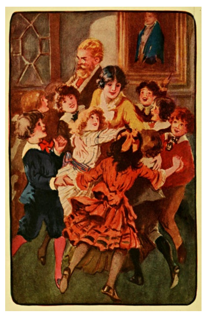
The good Professor and his wife were taken prisoner by many arms. See page 354. Frontispiece.

*** START OF THE PROJECT GUTENBERG EBOOK LITTLE MEN: LIFE AT PLUMFIELD WITH JO'S BOYS ***