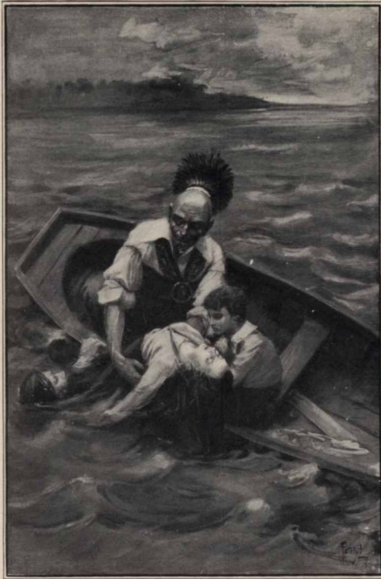
BLACK HAWK RESCUING GILBERT'S FATHER AND MOTHER. PAGE 33