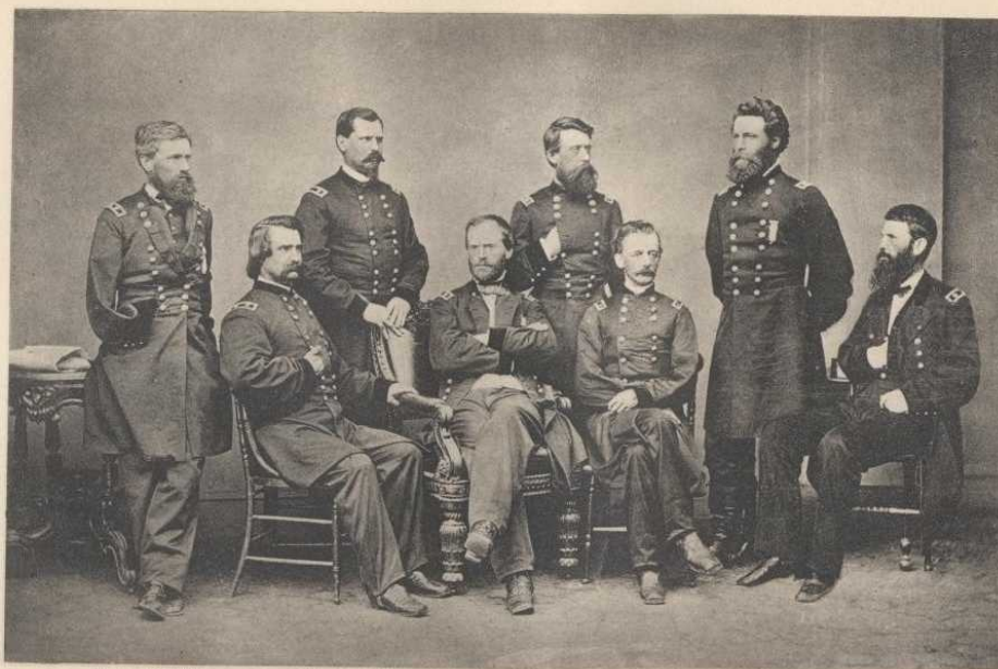
O. O. HOWARD. W. B. HAZEN. JEFF. C. DAVIS. JOSEPH A. MOWER. JOHN A. LOGAN. W. T. SHERMAN. H. W. SLOCUM. FRANK BLAIR. ARMY AND CORPS COMMANDERS—END OF THE WAR.