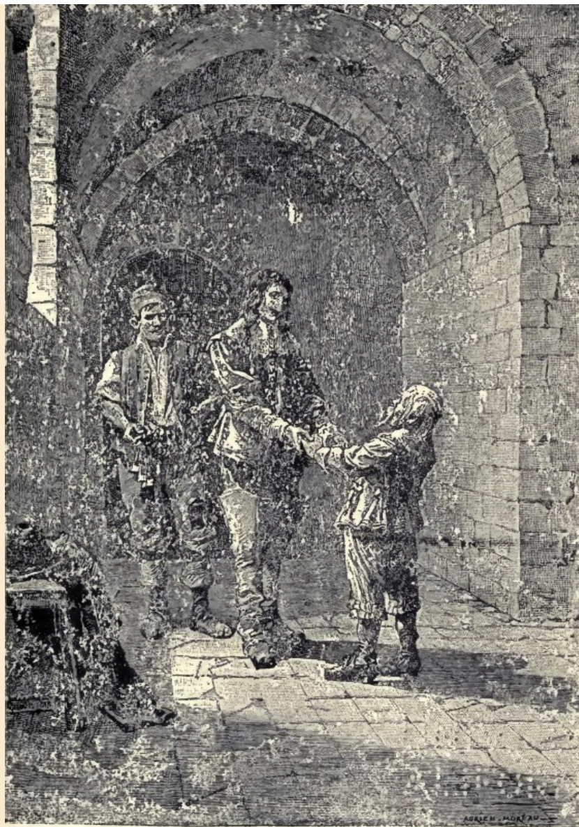
“The parting was not without emotion on both sides.”