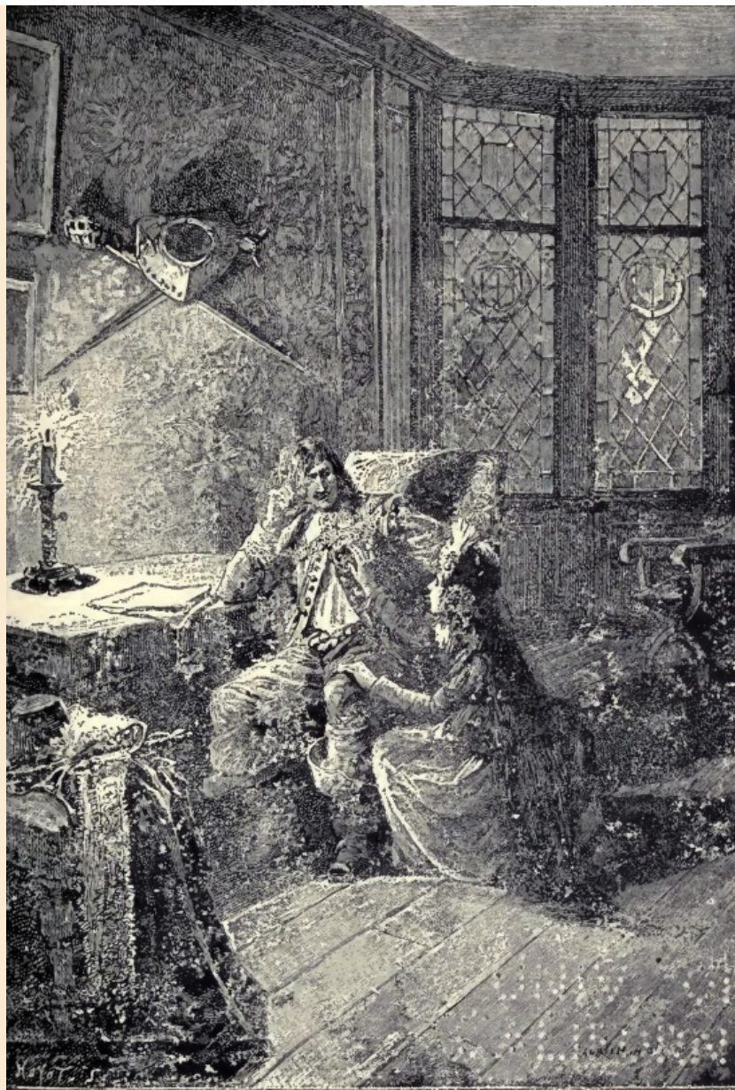
"He beheld beside him the little dumb maiden, the elfin Fenella."