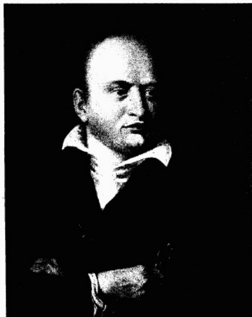
Benjamin Robert Haydon as a portrait by Forster