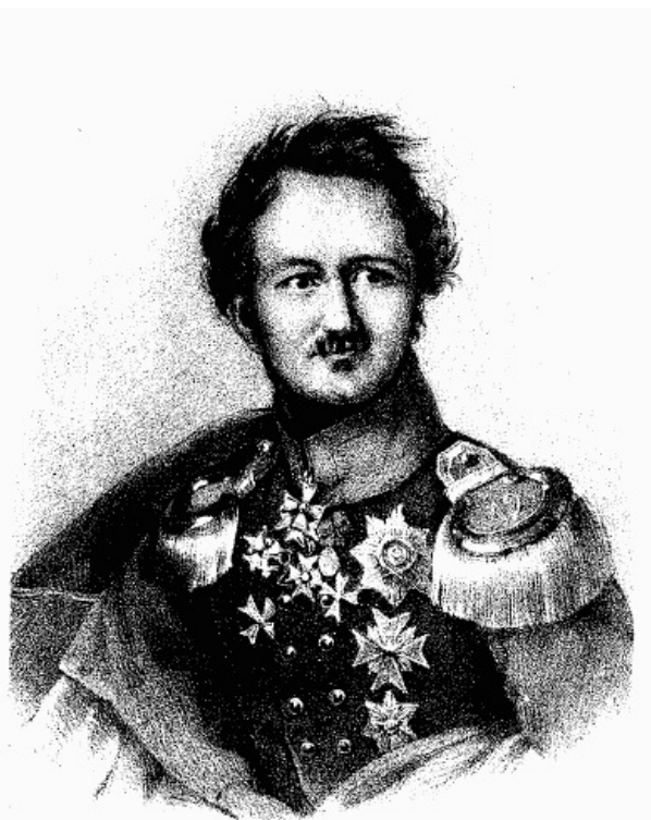
Art. Poppe. G. Prince Pückler-Muskau