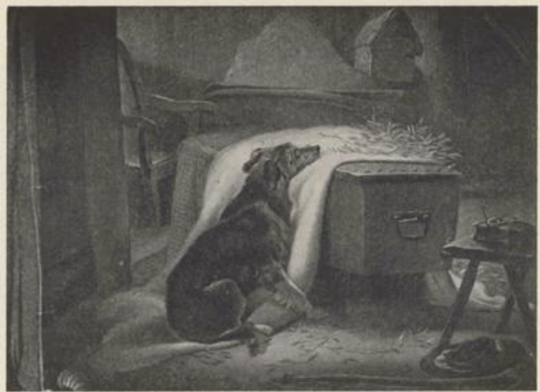
THE OLD SHEPHERD'S CHIEF MOURNER—Landseer

The dog in joy and the dog in sorrow, with his own kind, with human kind—Sir Edwin painted them all