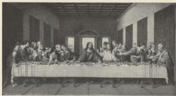
THE LAST SUPPER—Leonardo da Vinci Christ has just said "One of you shall betray me," and the disciples are asking "Is it I?" "Is it I?"

The Artist's Two Sons--Peter Paul Rubens