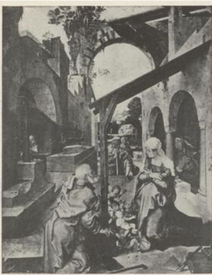
THE NATIVITY—Dürer Compare this with the Italian pictures of sacred subjects. The feeling is quite different

Moses Breaking the Tablets of the Law--Paul Gustave Doré