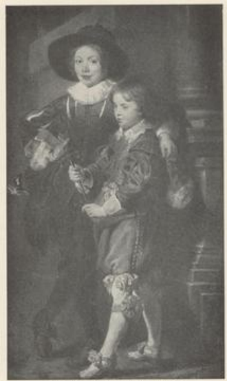
THE ARTIST'S TWO SONS—Rubens The younger one holds a perch for his pet bird which can fly off only the length of its string

The Artist's Two Sons--Peter Paul Rubens