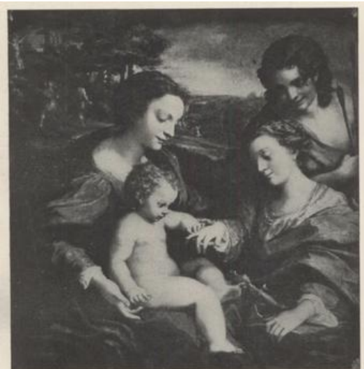
MYSTIC MARRIAGE OF ST. CATHERINE— Correggio The Saint of Alexandria considered herself the bride of Christ, having been married to him in a vision