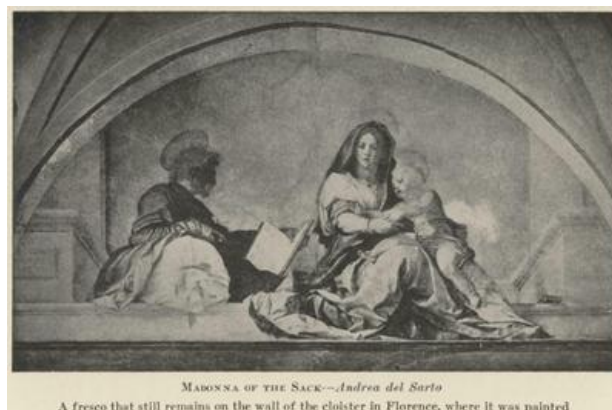
MADONNA OF THE SACK--Andrea del Sarto A fresco that still remains on the wall of the cloister in Florence, where it was painted

Throughout his life the artist longed for tenderness and encouragement from his wife, and finally, without ever receiving it, he died in a desolate way, untended even by her. After the siege of Florence there came a pestilence, and Andrea was overtaken by it. His wife, afraid that she too would become ill, would have nothing to do with him. She kept away and he died quite alone, few caring that he was dead and no one taking the trouble to follow him to his grave. Thus one of the greatest of Florentine painters lived and died. Years after his death, the artist Jacopo da Empoli, was copying Andrea's "Birth of the Virgin" when an old woman of about eighty years on her way to mass stopped to speak with him. She pointed to the beautiful Virgin's face in the picture and said: "I am that woman." And so she was--the widow of the great Andrea. Though she had treated him so cruelly, she was glad to have it known that she was the widow of the dead genius.