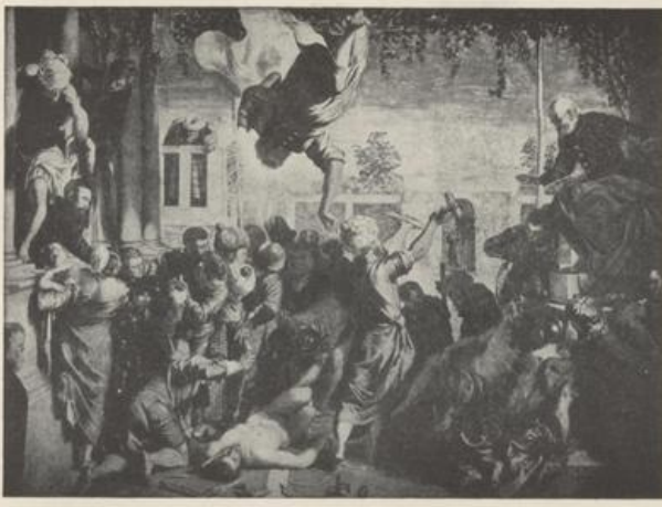
THE MIRACLE OF ST. MARK— Tintoretto

Notice the portrait of the artist himself at the lower corner on the left hand side