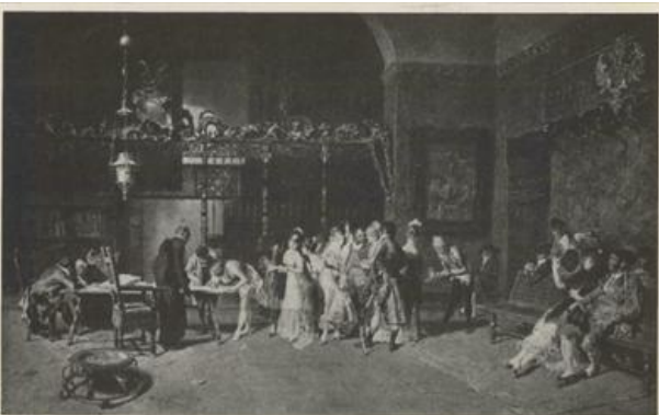
THE SPANISH MARRIAGE—Fortuny The signing of the register, elsewhere a solemn occasion, this artist has turned into a scene of gay frivolity