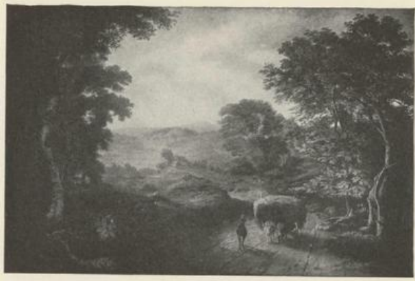
THE BERKSHIRE HILLS—Inness

Observe the fine perspective of the distant highlands, and the little cottage nestling under the trees