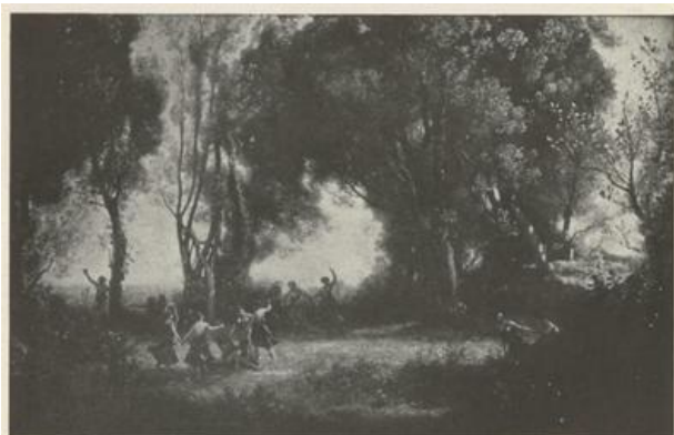
DANCE OF THE NYMPHS—Corot

One of the earliest, but also one of the best works of this master of light and shade, trees and atmosphere