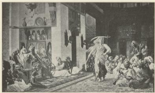
THE SWORD DANCE— Gérôme Compare with Scottish Sword Dance, where Highlander flings back and forth over sword to music of bagpipes

Mrs. Richard Brinsley Sheridan-- Thomas Gainsborough