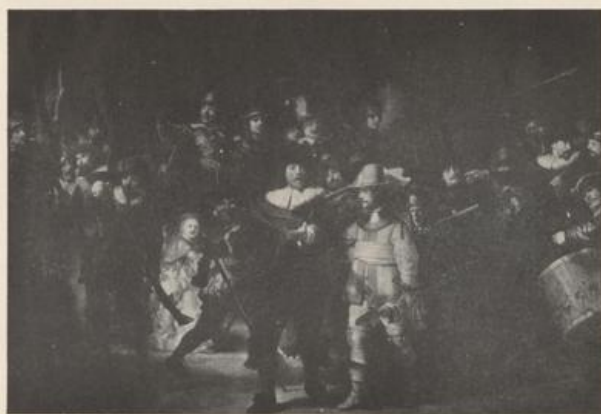
THE NIGHT WATCH--Rembrandt

The faces did not come out strongly enough from the artist's glorious shadows to please his patrons, who had bespoken portraits