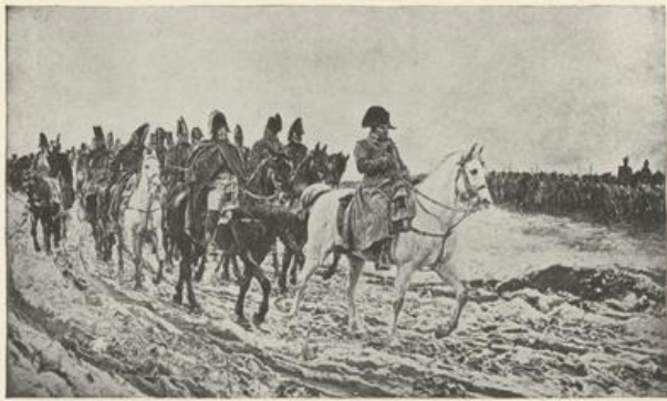
RETREAT FROM MOSCOW—Meissonier

Horses and men alike have a dejected air, but notice the set face of Napoleon