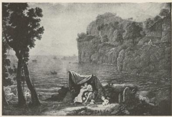
ACIS AND GALATEA—Lorrain

Polyphemus on the cliff seems too large for his sheep, but he is a giant who will soon hurl a mountain on the lovers