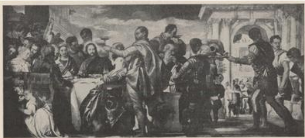
THE MARRIAGE AT CANA— Veronese

Equestrian Portrait of Don Balthasar Carlos-- Velasquez (Diego Rodriguez de Silva)