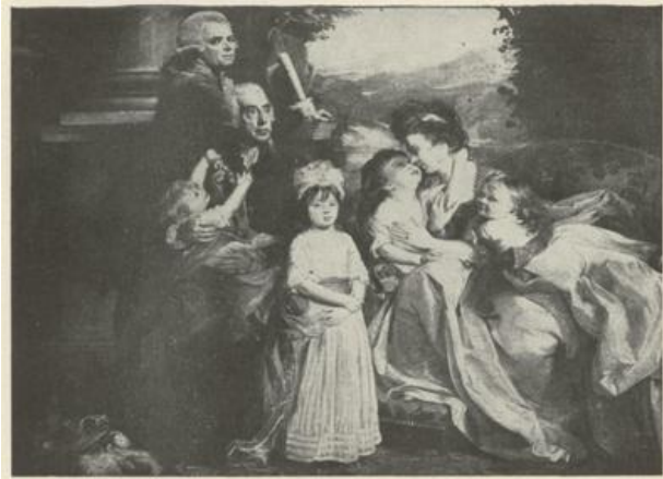
A FAMILY PICTURE—Copley

The prim little lady in front seems more dressed up than her mother