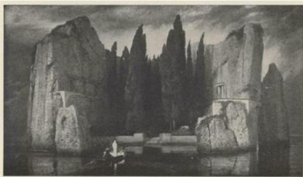
THE ISLE OF THE DEAD— Böcklin

A sombre scene, befitting a sombre subject. The straight lines are specially noticeable.