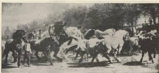
THE HORSE FAIR— Rosa Bonheur

A famous canvas that can be seen in the Metropolitan Art Gallery, New York City