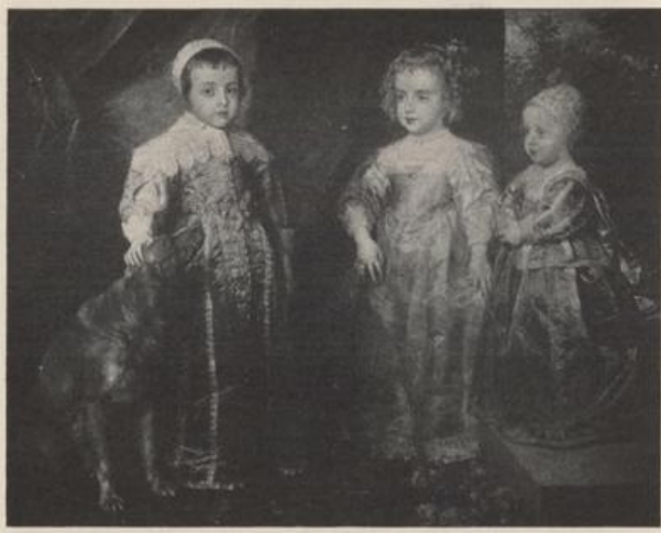
CHILDREN OF CHARLES I.— Van Dyck

Prince of Wales, afterward Charles II.; Princess Mary, who married the Prince of Orange; Duke of York, afterward James II.