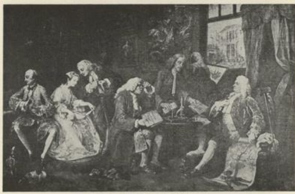
THE MARRIAGE CONTRACT—Hogarth

The first act in a great moral drama of five acts called "Marriage à la Mode." The series hangs in the National Gallery, London