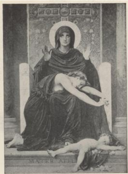
THE VIRGIN AS CONSOLER— Bouguereau The mother of the dead child seems to need all the help from heaven the Virgin Mary can bring down