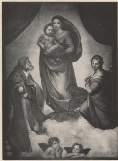
THE SISTINE MADONNA--Raphael

By many critics considered to be the greatest painting in the world