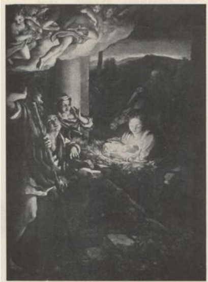
THE HOLY NIGHT—Correggio

Another name for the picture is "The Adoration of the Shepherds," which seems to explain it better