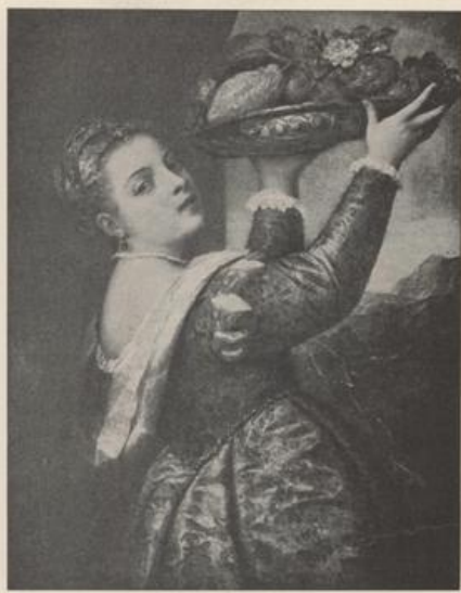
THE ARTIST'S DAUGHTER— Titian

The Miracle of St. Mark-- Tintoretto ( Jacopo Robusti )