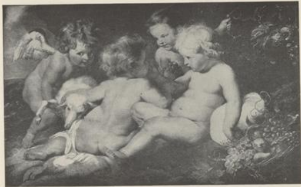
THE INFANT JESUS AND ST. JOHN— Rubens The artist famed for his Venus festivals, his battles, his mournful sacred scenes can also portray the playfulness of childhood

The Duchess of Devonshire and Her Daughter-- Sir Joshua Reynolds