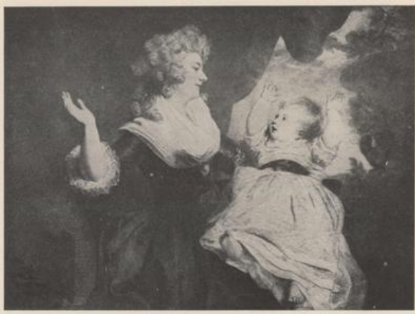
THE DUCHESS OF DEVONSHIRE AND HER DAUGHTER— Reynolds Notice the baby's chubby feet, and the lovely arm of the mother

The Duchess of Devonshire and Her Daughter-- Sir Joshua Reynolds