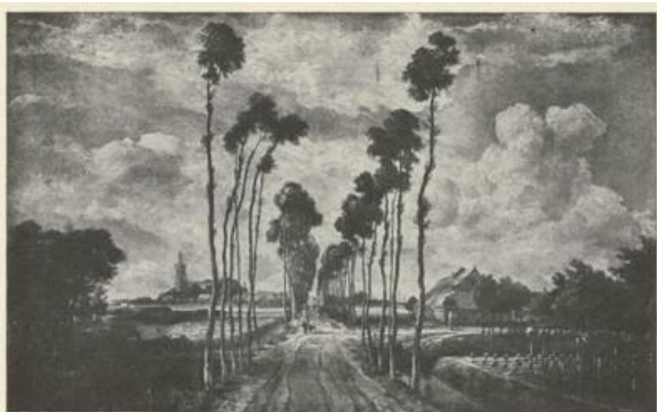
THE AVENUE, MIDDELHAARN, HOLLAND— Hobbema The trees may typify a land denuded of former greatness, but to the right is a thrifty Dutch homestead and garden, to the left a suggestive church spire