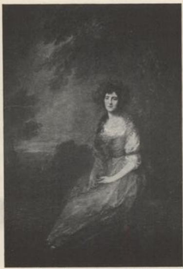
Mrs. RICHARD BRINSLEY SHERIDAN— Gainsborough Notice the sweetly pensive expression of the face, the lovely hand and arm, and the transparency of the draperies

Mrs. Richard Brinsley Sheridan-- Thomas Gainsborough