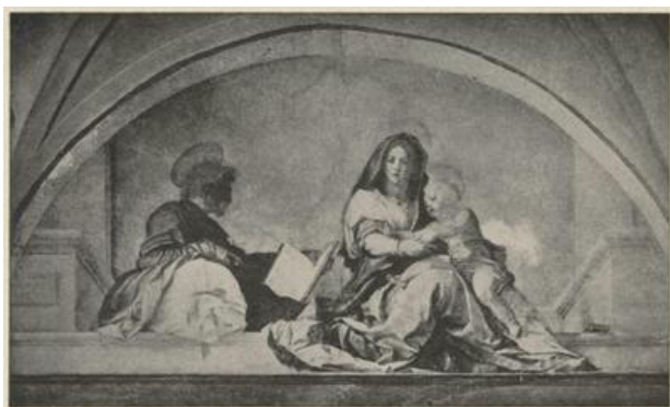
MADONNA OF THE SACK— Andrea del Sarto