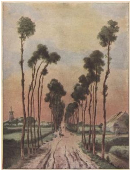
The Avenue, Middleharnis, Holland— Hobbema