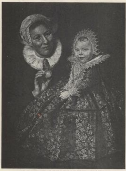
THE NURSE AND THE CHILD— Franz Hals Probably the artist kept these two amused with some of his drolleries while he painted their picture