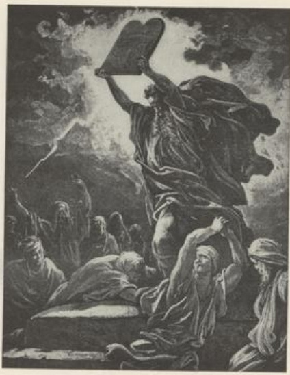
MOSES BREAKING THE TABLETS OF THE LAW—Doré This is one of the illustrations of the Doré Bible, published in 1865

Moses Breaking the Tablets of the Law--Paul Gustave Doré