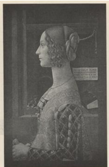
GIOVANNA DEGLI ALBIZI— Ghirlandajo The tablet states that if art could have painted her mind and manner, no picture on earth would have been more beautiful

Portrait of Giovanna degli Albizi-- Ghirlandajo (Domenico Bigordi)