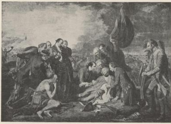
THE DEATH OF WOLFE—West The hero is dying at the very moment when he has won a continent for the Anglo-Saxon race