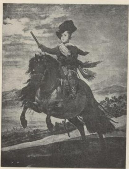
DON BALTHASAR CARLOS— Velasquez

The Children of Charles the First-- Sir Anthony Van Dyck