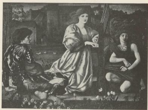
THE LOVE SONG— Burne-Jones A song without words it seems to be, and directed by the lady player to the youth at her right