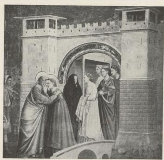
MEETING OF ST. JOHN AND ST. ANNA— Giotto A fourteenth century fresco, showing great advance on the few paintings that preceded it