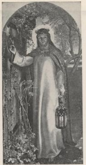
THE LIGHT OF THE WORLD—Holman Hunt

Perhaps the most popular picture of a sacred subject ever painted. It is in Keble College, Oxford