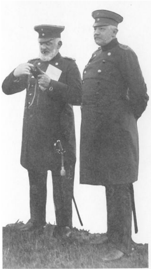
GENERALS VON HEERINGEN AND VON MOLTKE