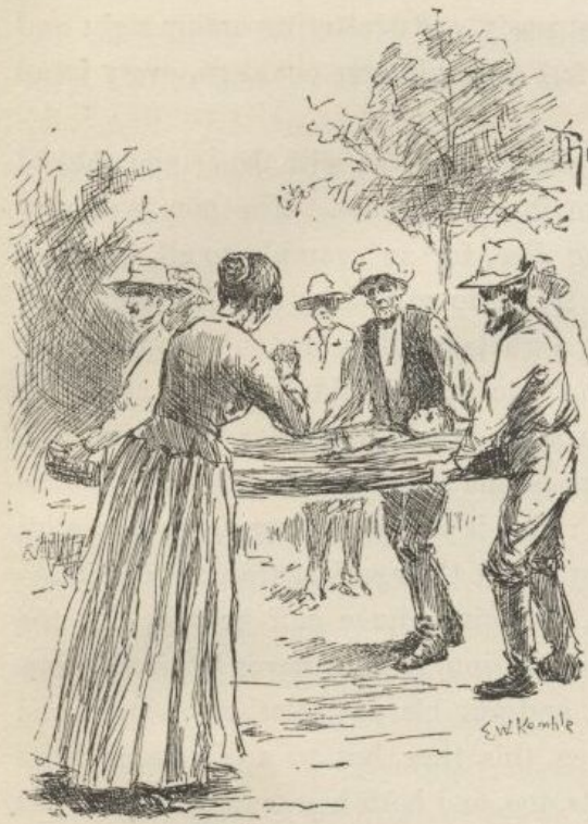
TOM SAWYER WOUNDED.

The old man was up town again, before breakfast, but couldn't get no track of Tom; and both of them set at the table, thinking, and not saying nothing, and looking mournful, and their coffee getting cold, and not eating anything. And by-and-by the old man says :