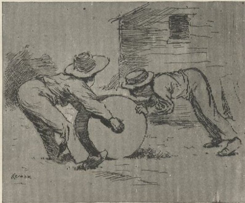
A TOUGH JOB

It warn't no slouch of an idea; and it warn't no slouch of a grindstone nuther; but we allowed we'd tackle it. It warn't quite midnight yet, so we cleared out for the mill, leaving Jim at work. We smouched the grindstone, and set out to roll her home, but it was a most nation tough job. Sometimes, do what we could, we couldn't keep her from falling over, and she come mighty near mashing us every time. Tom said she was going to get one of us, sure, before we got through. We got her half way; and then we was plumb played out, and most drownded with sweat. We see it warn't no use; we got to go and fetch Jim So he raised up his bed and slid the chain off of the bed-leg, and wrapt it round and round his neck, and we crawled out through our hole and down there, and Jim and me laid into that grindstone and walked her along like nothing; and Tom superintended. He could out-superintend any boy I ever see. He knowed how to do everything.