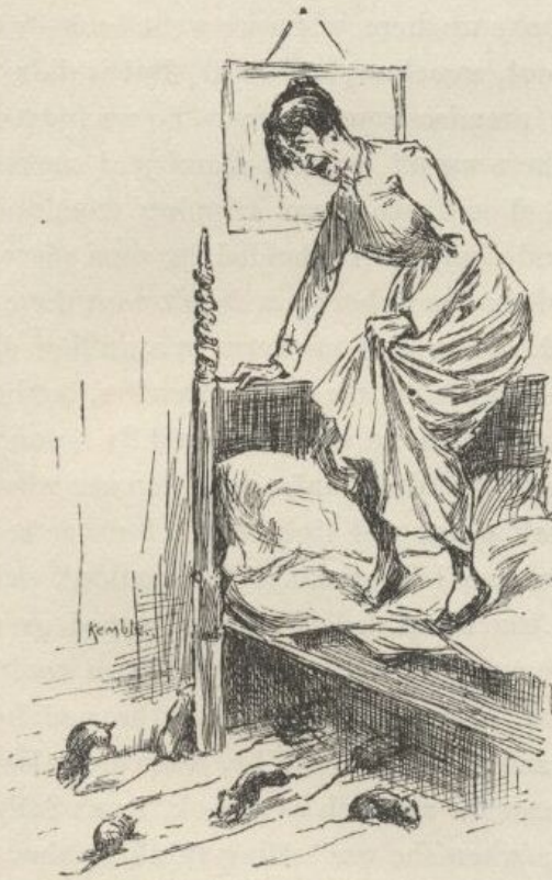
KEEPING OFF DULL TIMES.

In the morning we went up to the village and bought a wire rat trap and fetched it down, and unstopped the best rat hole, and in about an hour we had fifteen of the bulliest kind of ones ; and then we took it and put it in a safe place under Aunt Sally's bed. But while we was gone for spiders, little Thomas Franklin Benjamin Jefferson Elexander Phelps found it there, and opened the door of it to see if the rats would come out, and they did ; and Aunt Sally she come in, and when we got back she was a standing on top of the bed raising Cain, and the rats was doing what they could to keep off the dull times for her. So she took and dusted us both with the hickry, and we was as much as two hours catching another fifteen or sixteen, drat that meddlesome cub, and they