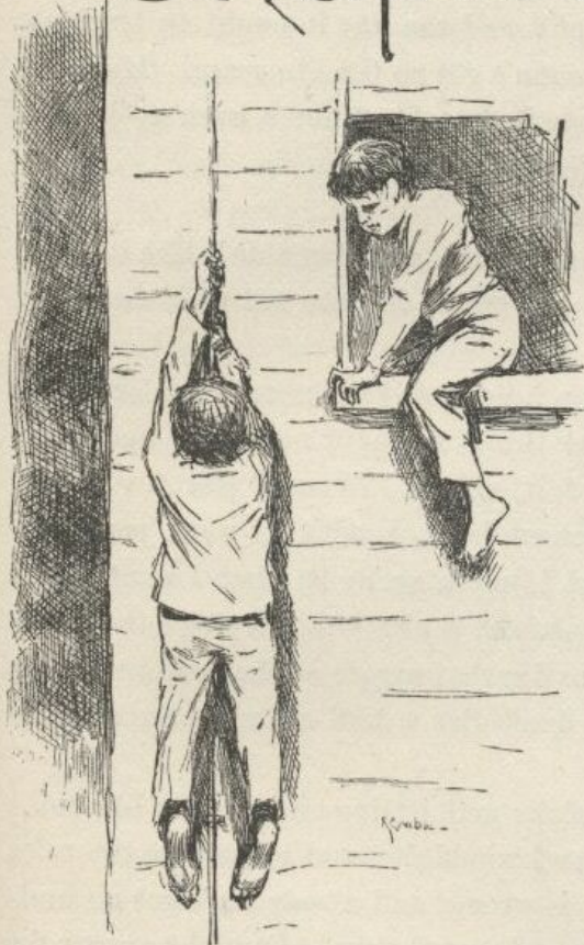
GOING DOWN THE LIGHTNING-ROD.

As soon as we reckoned everybody was asleep, that night, we went down the lightning-rod, and shut ourselves up in the lean-to, and got out our pile of fox-fire, and went to work. We cleared everything out of the way, about four or five foot along the middle of the bottom log. Tom said he was right behind Jim's bed now, and we'd dig in under it, and when we got through there couldn't nobody in the cabin ever know there was any hole there, because Jim's counterpin hung down most to the ground, and you'd have to raise it up and look under to see the hole. So we dug and dug, with the case-knives, till most midnight; and then we was dog-tired, and our hands was blistered, and yet you