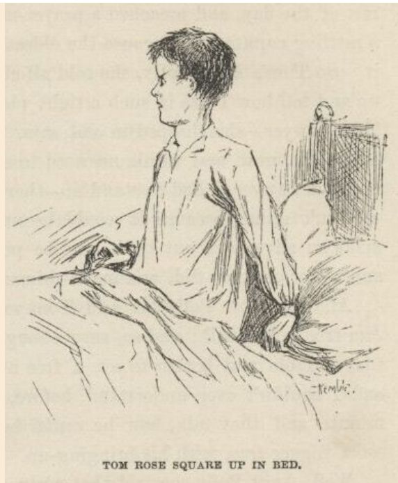
TOM ROSE SQUARE UP IN BED.

Tom rose square up in bed, with his eye hot, and his nostrils opening and shutting like gills, and sings out to me: