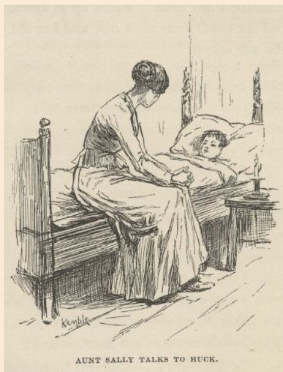
AUNT SALLY TALKS TO HUCK.

He come back about ten a little bit uneasy; hadn't run across Tom's track. Aunt Sally was a good DEAL uneasy; but Uncle Silas he said there warn't no occasion to be—boys will be boys, he said, and you'll see this one turn up in the morning all sound and right. So she had to be satisfied. But she said she'd set up for him a while anyway, and keep a light burning so he could see it.