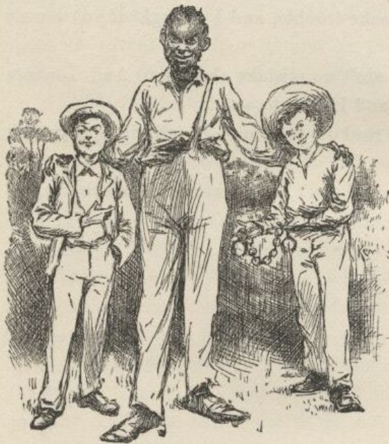
OUT OF BONDAGE.

The first time I caught Tom, private, I asked him what was his idea, time of the evasion?—what it was he'd planned to do if the evasion worked all right and he managed to set a nigger free that was already free before? And he said, what he had planned in his head, from the start, if we got Jim out all safe, was for us to run him down the river, on the raft, and have adventures plumb to the mouth of the river, and then tell him about his being free, and take him back up home on a steamboat, in style, and pay him for his lost time, and write word ahead and get out all the niggers around, and have them waltz him into town with a torchlight