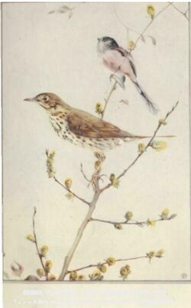
SONG THRUSH AND LONG-TAILED TIT.

" . . . a tree made choice of by a song-thrush as a singing-sland"