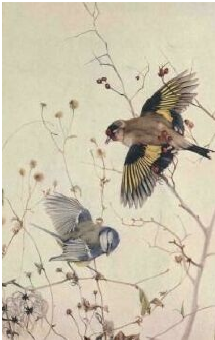
GOLDFINCH AND BLUE TIT.

*** START OF THE PROJECT GUTENBERG EBOOK BIRDS IN TOWN & VILLAGE ***