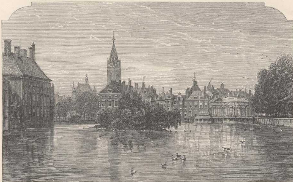
VIEW OF THE VYVERBERG AT THE HAGUE.

You must show your teeth to the Spaniard