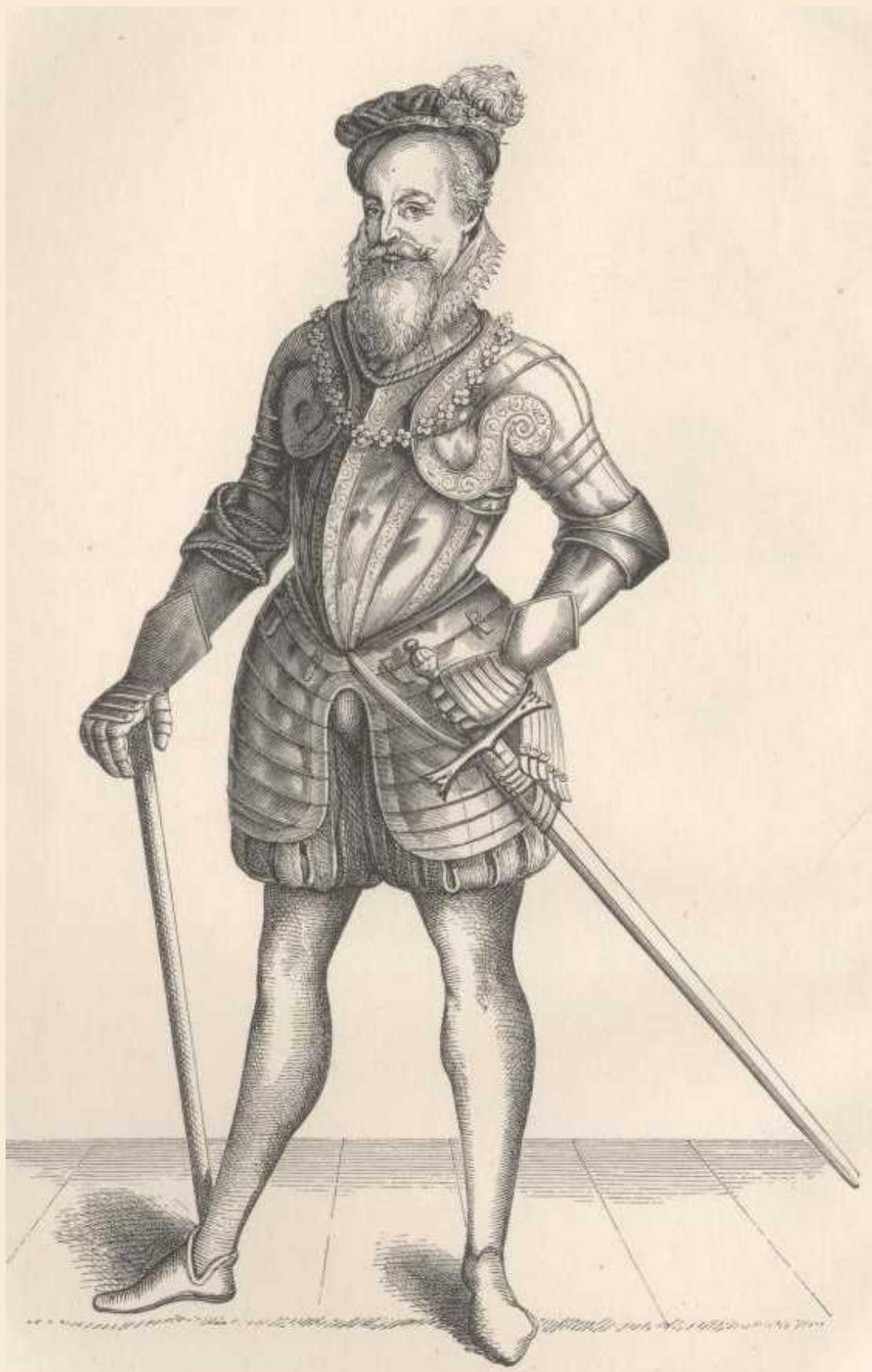
THE EARL OF LEICESTER.