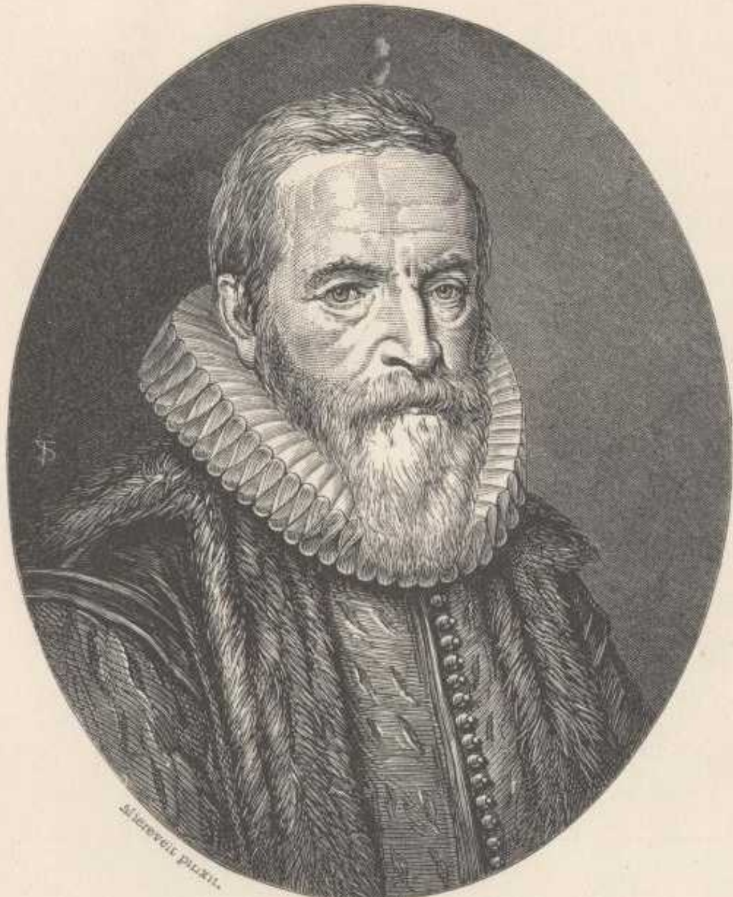
JOHAN VAN OLDEN-BARNEVELD.