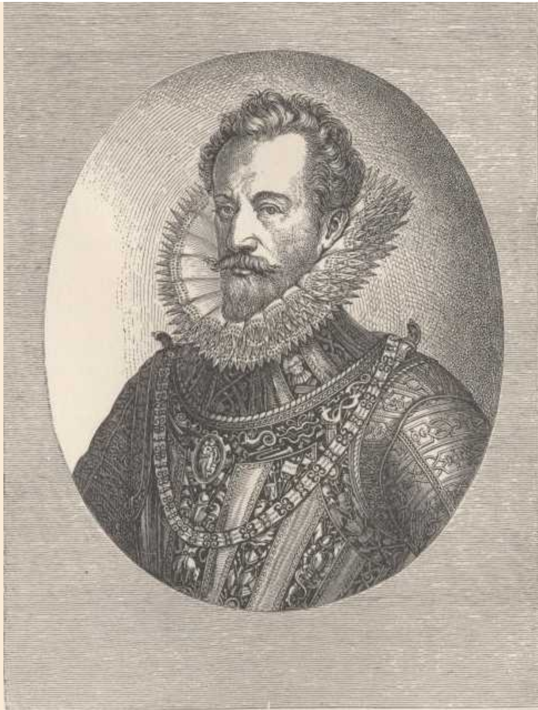
ALEXANDER FARNESE, PRINCE OF PARMA.