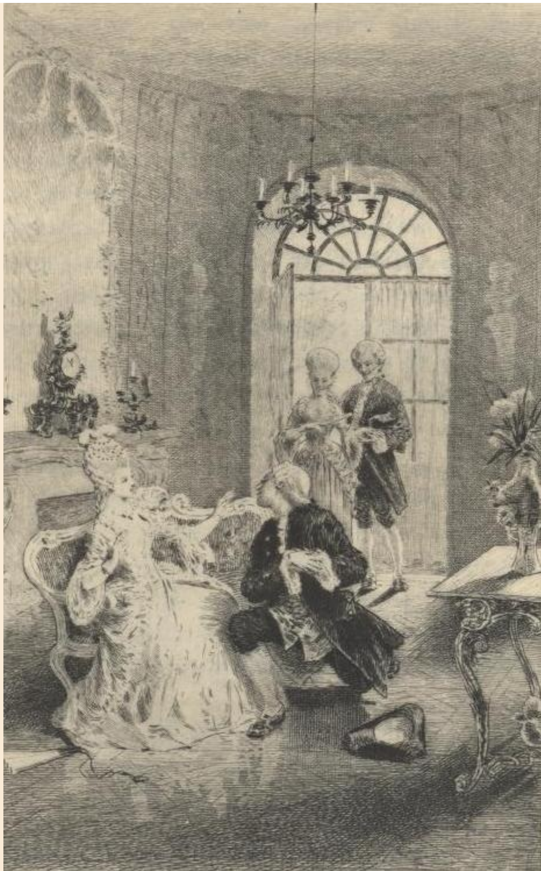
Marie Antoinette and Louis XVI.