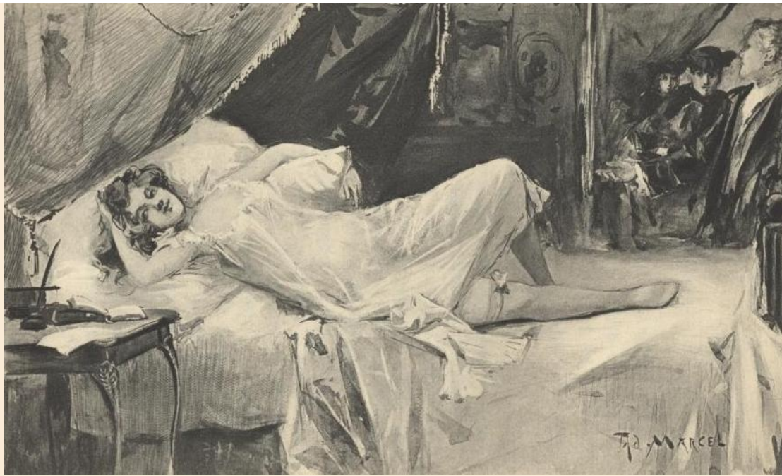
At Cardinal Caprara's