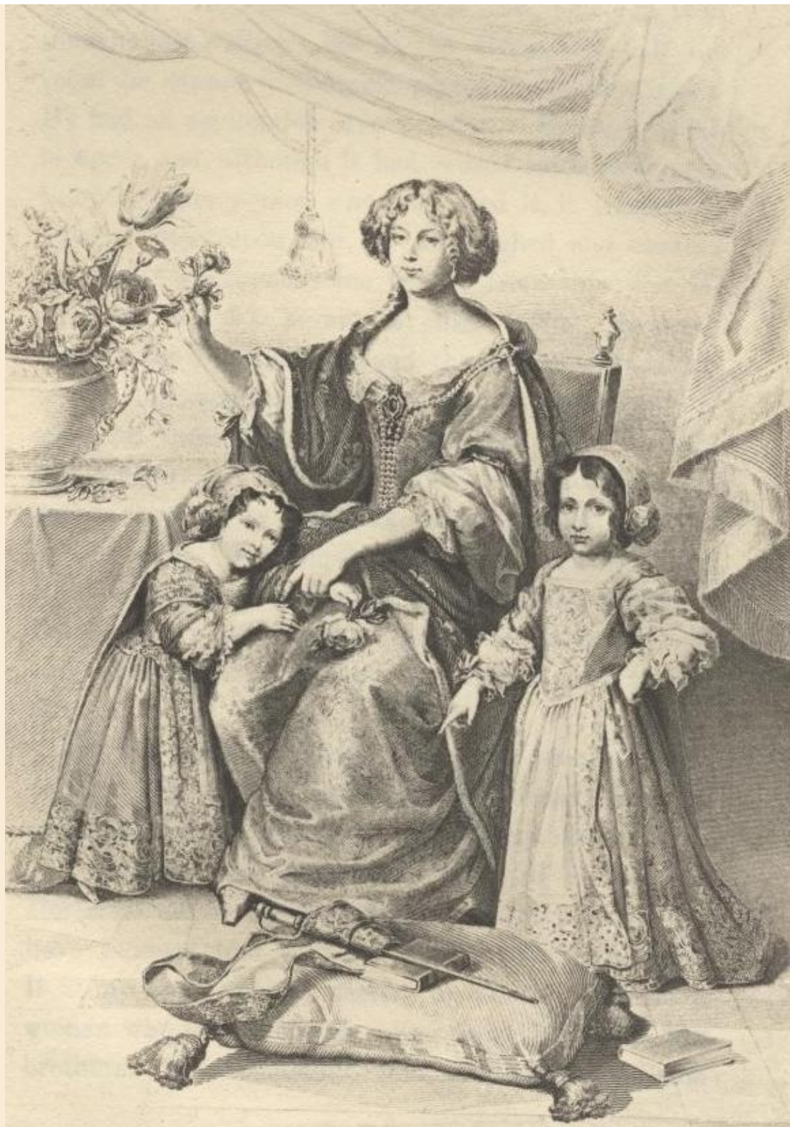
Elizabeth-Charlotte, Duchesse D'Orleans and Her Children