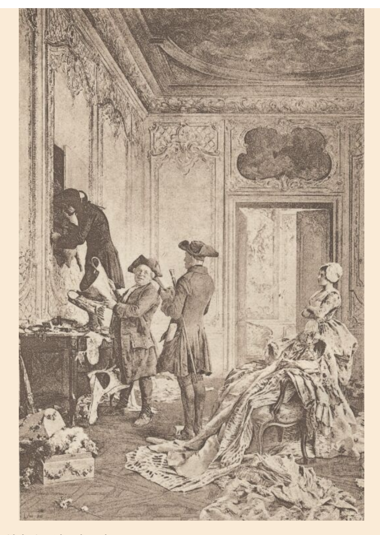
Search Of The Spanish Ambassador

A cardinal may be poisoned, stabbed, got rid of altogether