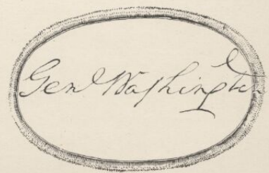
Washington's visiting Cards