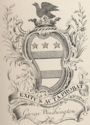
Washington's Book Plate