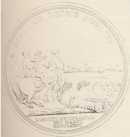
Copy of a Gold Medal presented to General