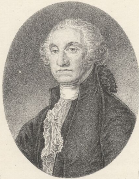
Pitcher Portrait of WASHINGTON.