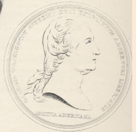
Washington by Congress on the Evacuation of Boston