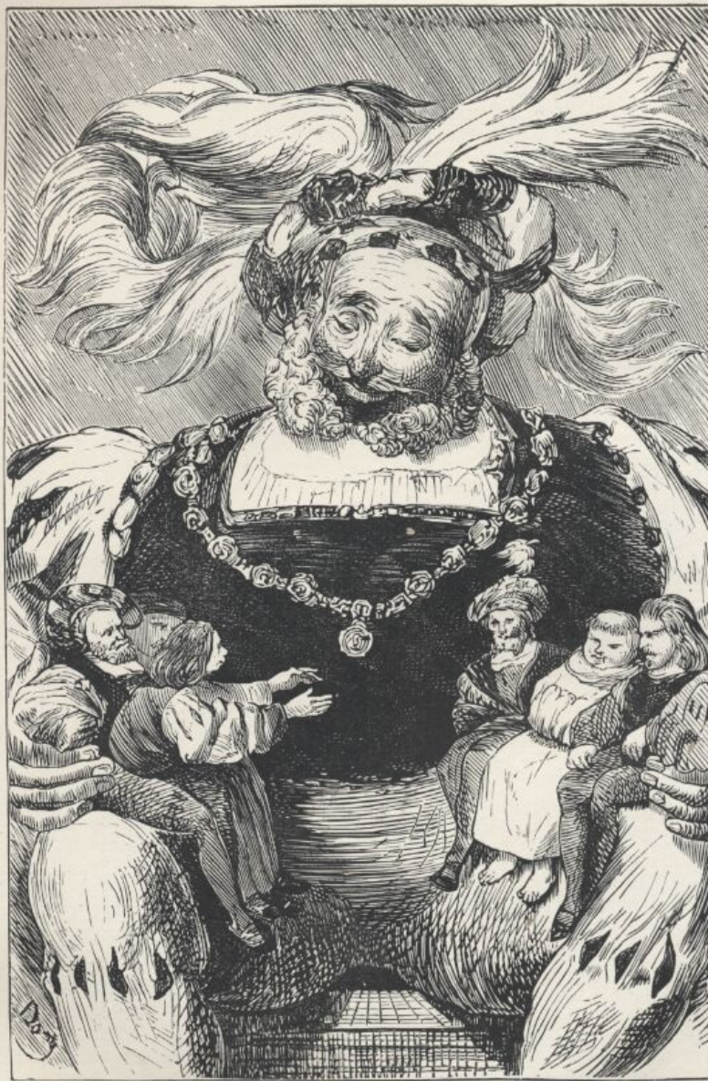
Panurge seeks the advice of Pantagruel and his friends as to whether he should marry.

Will you maintain, quoth Pantagruel, that the codpiece is the chief piece of a military harness? It is a new kind of doctrine, very paradoxical; for we say, At spurs begins the arming of a man. Sir, I maintain it, answered Panurge, and not wrongfully do I maintain it. Behold how nature, having a fervent desire, after its production of plants, trees, shrubs, herbs, sponges, and plant-animals, to eternize and continue them unto all succession of ages (in their several kinds or sorts, at least, although the individuals perish) unruinable, and in an everlasting being, hath most curiously armed and fenced their buds, sprouts, shoots, and seeds, wherein the above-mentioned perpetuity consisteth, by strengthening, covering, guarding, and fortifying them with an admirable industry, with husks, cases, scurfs and swads, hulls, cods, stones, films, cartels, shells, ears, rinds, barks, skins, ridges, and prickles, which serve them instead of strong, fair, and natural codpieces. As is manifestly apparent in pease, beans, fasels, pomegranates, peaches, cottons, gourds, pumpions, melons, corn, lemons, almonds, walnuts, filberts, and chestnuts; as likewise in all plants, slips, or sets whatsoever, wherein it is plainly and evidently seen, that the sperm and semence is more closely veiled, overshadowed, corroborated, and thoroughly harnessed, than any other part, portion, or parcel of the whole.