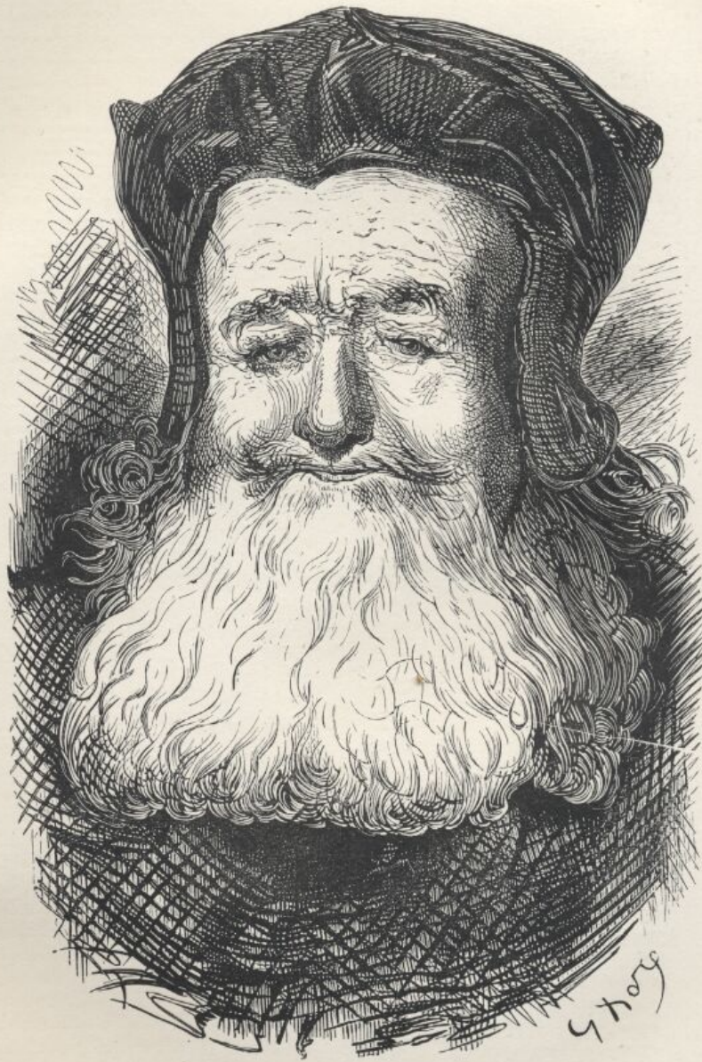
RONDIBILIS THE PHYSICIAN.

The dinner on the subsequent Sunday was no sooner made ready than that the aforementioned invited guests gave thereto their appearance, all of them, Bridlegoose only excepted, who was the deputy-governor of Fonsbeton. At the ushering in of the second service Panurge, making a low reverence, spake thus: Gentlemen, the question I am to propound unto you shall be uttered in very few words—Should I marry or no? If my doubt herein be not resolved by you, I shall hold it altogether insolvable, as are the Insolubilia de Aliaco ; for all of you are elected, chosen, and culled out from amongst others, everyone in his own condition and quality, like so many picked peas on a carpet.