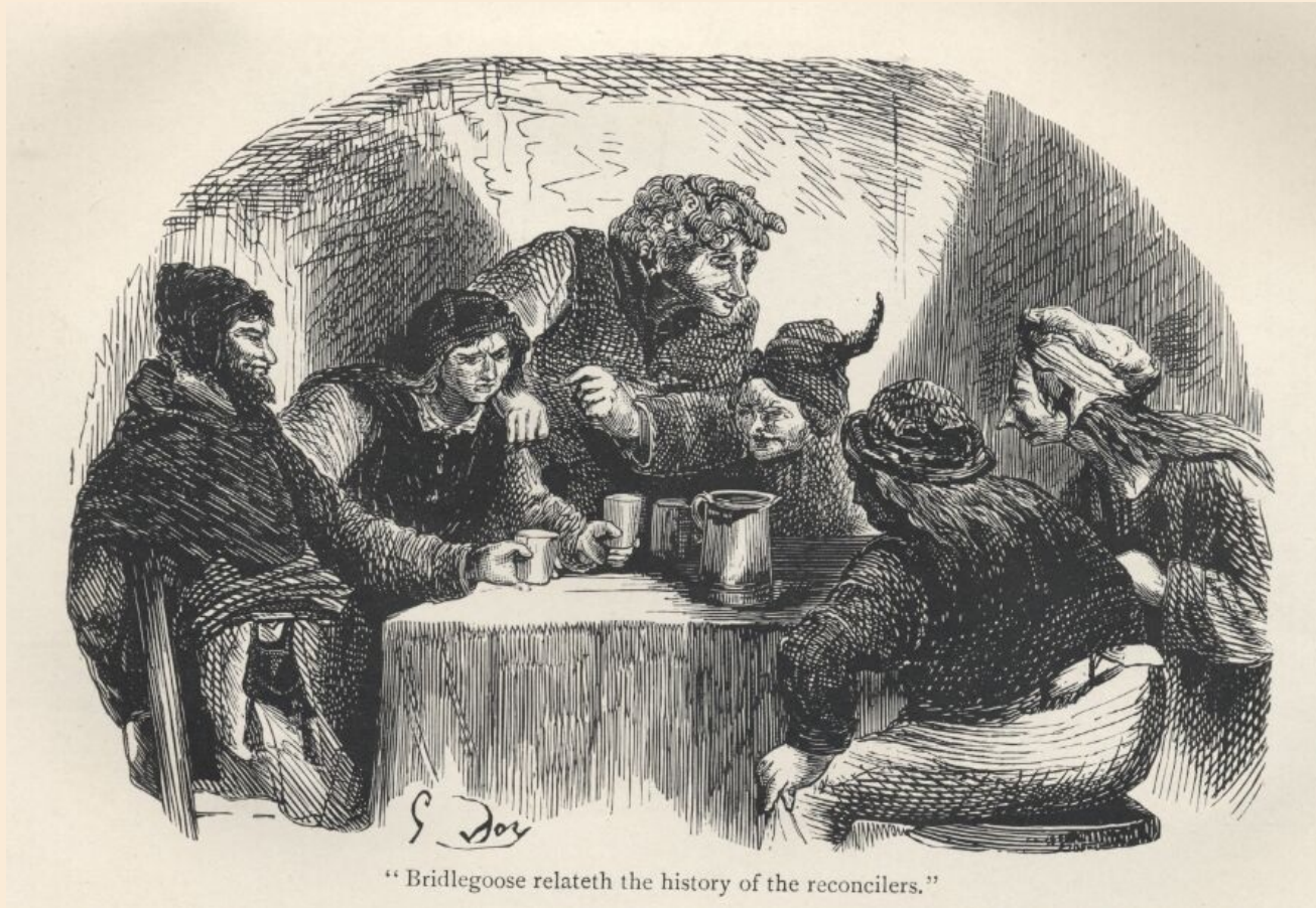
“Bridlegoose relateth the history of the reconcilers.”