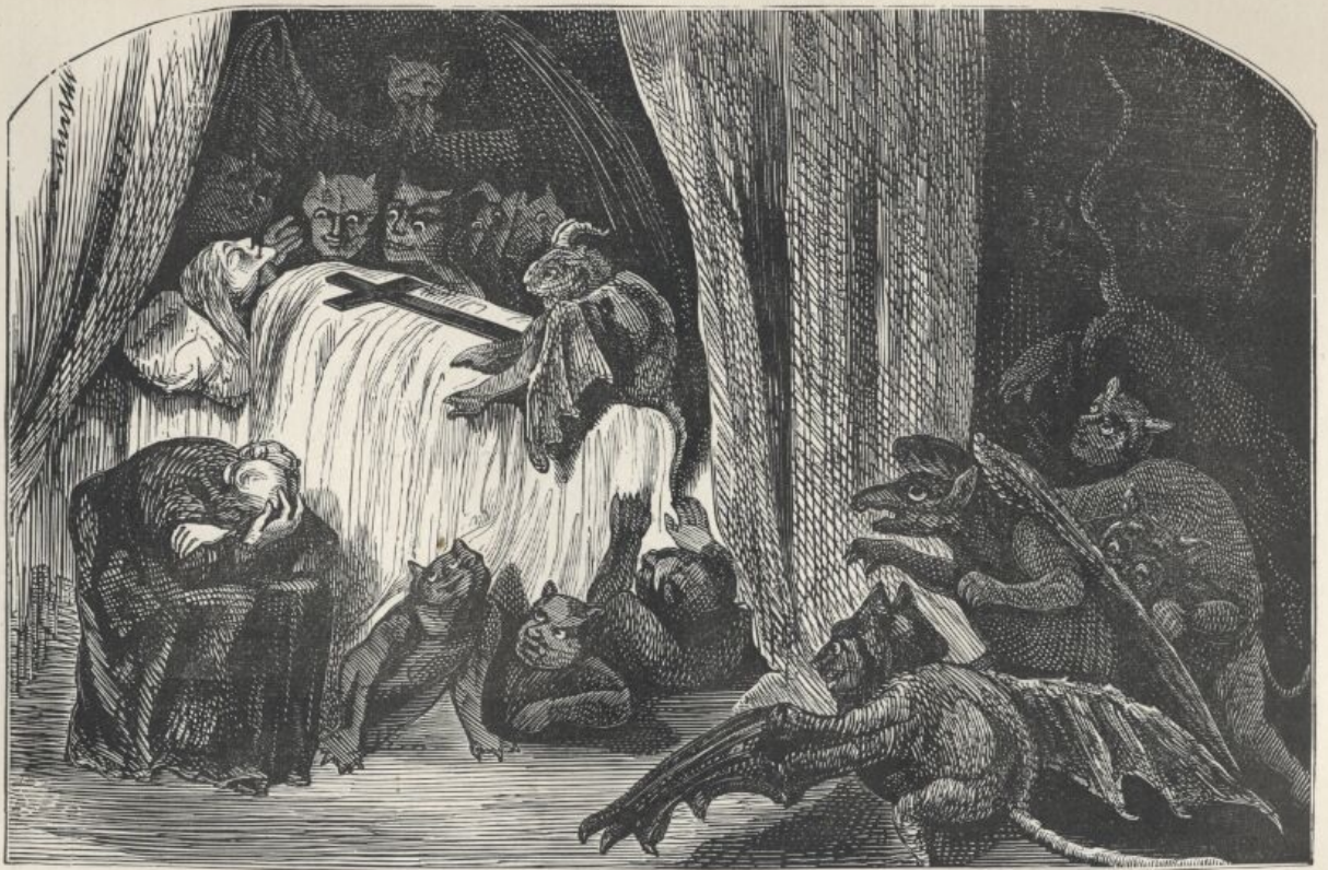
“The chamber is already full of devils.”