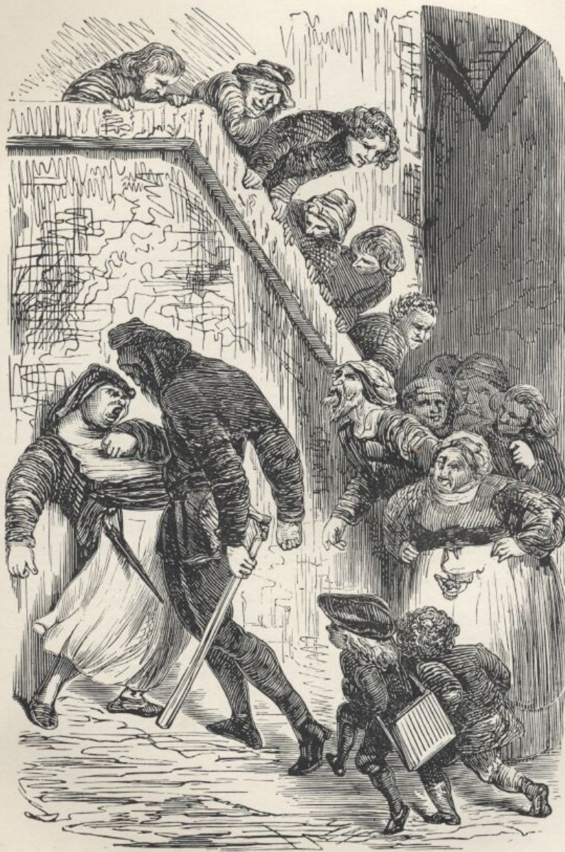
“The altercation waxed hot in words ; which moved the gaping hoydens of the sottish Parisians to run from all parts thereabouts.”

When Pantagruel had withdrawn himself, he, by a little sloping window in one of the galleries, perceived Panurge in a lobby not far from thence, walking alone, with the gesture, carriage, and garb of a fond dotard, raving, wagging, and shaking his hands, dandling, lolling, and nodding with his head, like a cow bellowing for her calf; and, having then called him nearer, spoke unto him thus: You are at this present, as I think, not unlike to a mouse entangled in a snare, who the more that she goeth about to rid and unwind herself out of the gin wherein she is caught, by endeavouring to clear and deliver her feet from the pitch whereto they stick, the foulier she is bewrayed with it, and the more strongly pestered therein. Even so is it with you. For the more that you labour, strive, and enforce yourself to disencumber and extricate your thoughts out of the implicating involutions and fetterings of the grievous and lamentable gins and springs of anguish and perplexity, the greater difficulty there is in the relieving of you, and you remain faster bound than ever. Nor do I know for the removal of this inconveniency any remedy but one.