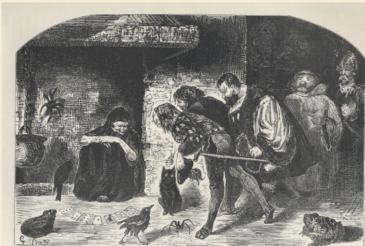
“They found the old woman sitting in a corner of her chimney.”