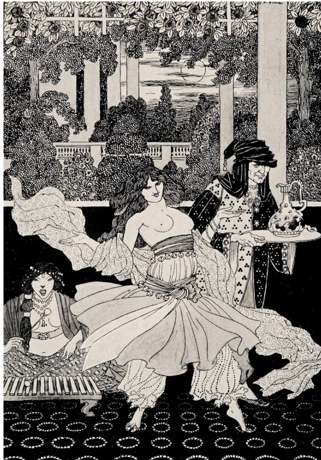
Pattering Leaves Danced