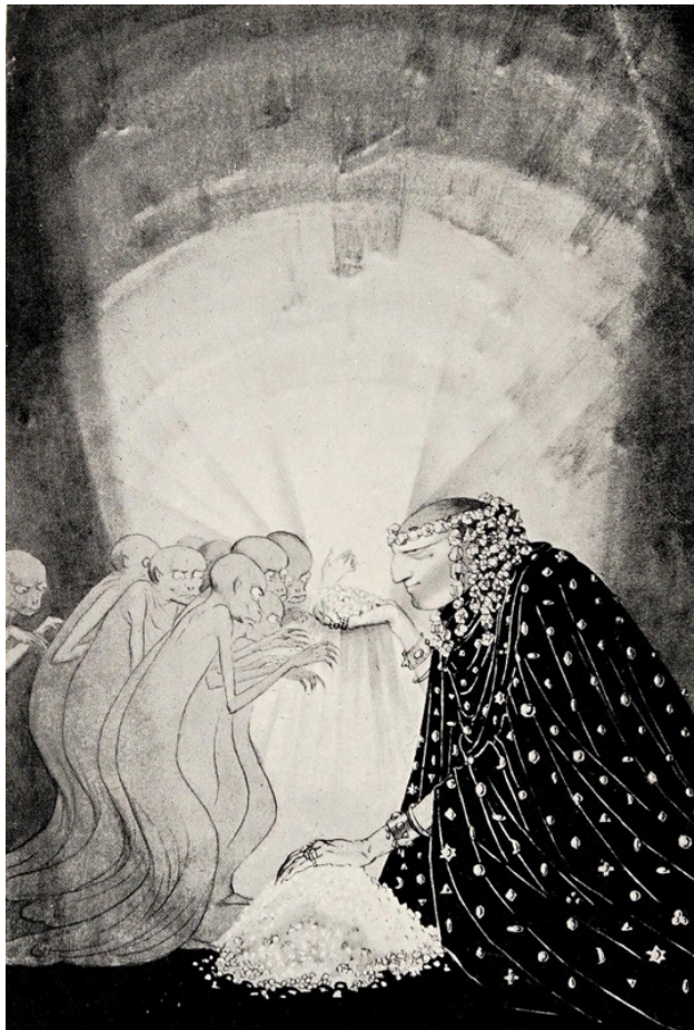
The Opulence of Yahn