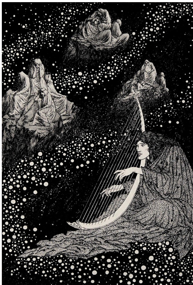
The Dirge of Shimono Kani

“And when the music of one lute is lonely on the hills at night, then one