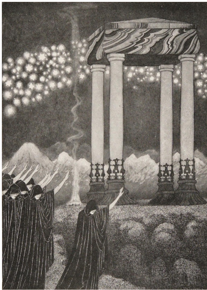
The Tomb of Morning Zai.