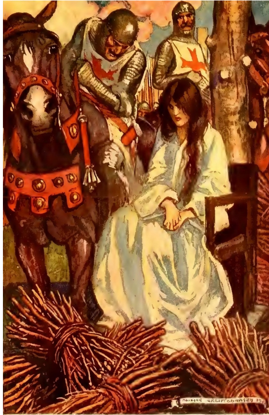
"Mount thee behind me on my steed—on Zamor, the gallant horse that never failed his rider."

"Dreams, Rebecca,—dreams," answered the Templar; "idle visions, rejected by the wisdom of your own wiser Sadducees. Hear me, Rebecca," he said, proceeding with animation; "a better chance hast thou for life and liberty than yonder knaves and dotard dream of. Mount thee behind me on my steed—on Zamor, the gallant horse that never failed his rider. I won him in single fight from the Soldan of Trebizond—mount, I say, behind me—in one short hour is pursuit and enquiry far behind—a new world of pleasure opens to thee—to me a new career of fame. Let them speak the doom which I despise, and erase the name of Bois-Guilbert from their list of monastic slaves! I will wash out with blood whatever blot they may dare to cast on my scutcheon."