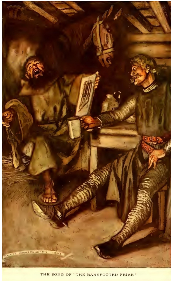
THE SONG OF 'THE BAREFOOTED FRIAR'