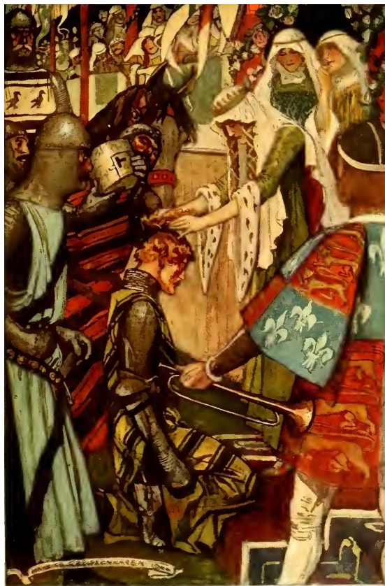
The Marshals unhelmed him by cutting the laces of his casque.

Whether from love of form, or from curiosity, the marshals paid no attention to his expressions of reluctance, but unhelmed him by cutting the laces of his casque, and undoing the fastening of his gorget. When the helmet was removed, the well-formed, yet sun-burnt features of a young man of twenty-five were seen, amidst a profusion of short fair hair. His countenance was as pale as death, and marked in one or two places with streaks of blood.