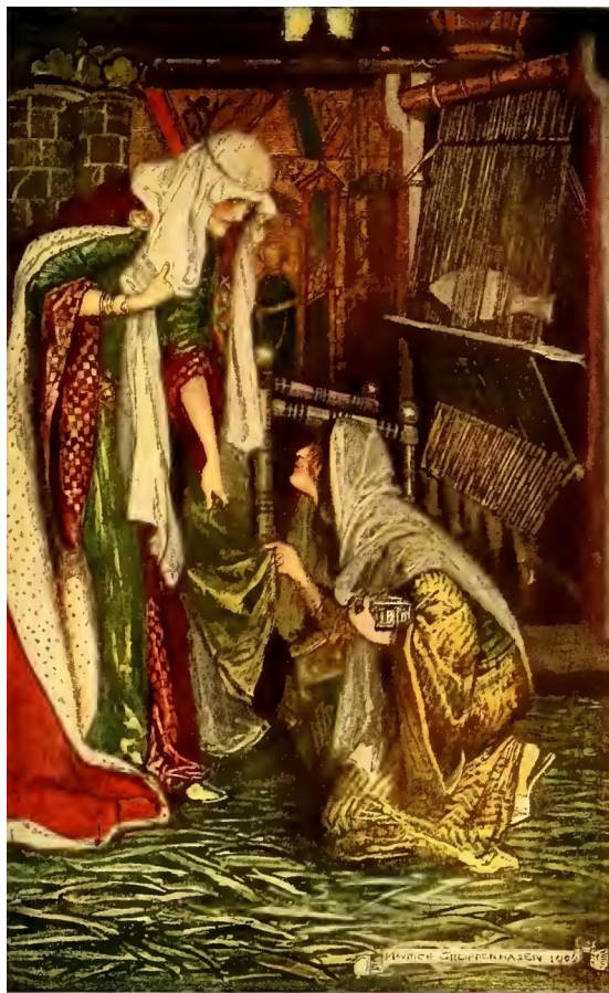
To the surprise of the Lady of Ivanhoe, her fair visitant kneeled on one knee.

“What means this, lady?” said the surprised bride; “or why do you offer to me a deference so unusual?”