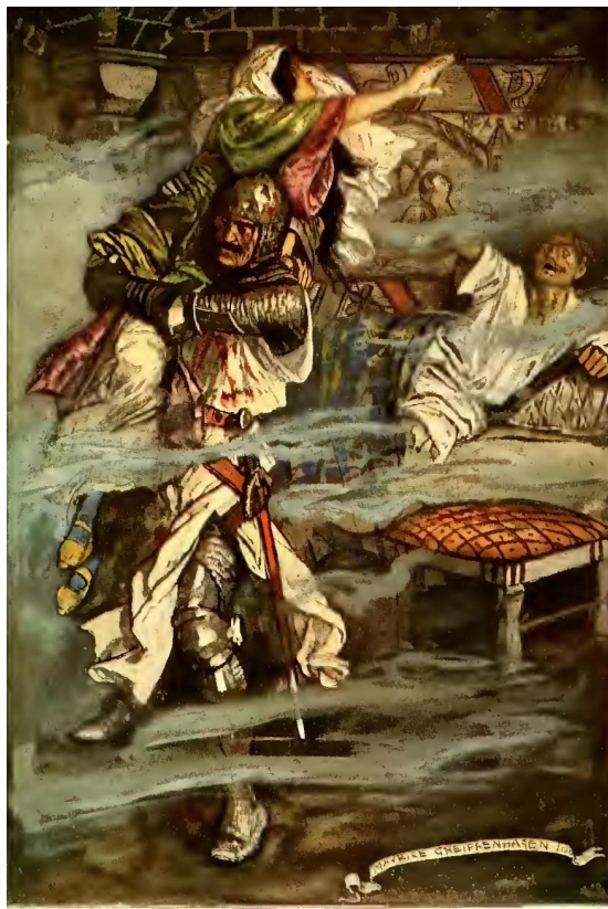
So saying, he seized on the terrified maiden, and bore her out of the room in his arms in spite of her cries.

"I had not found thee, Wilfred," said the Black Knight, who at that instant entered the apartment, "but for thy shouts."