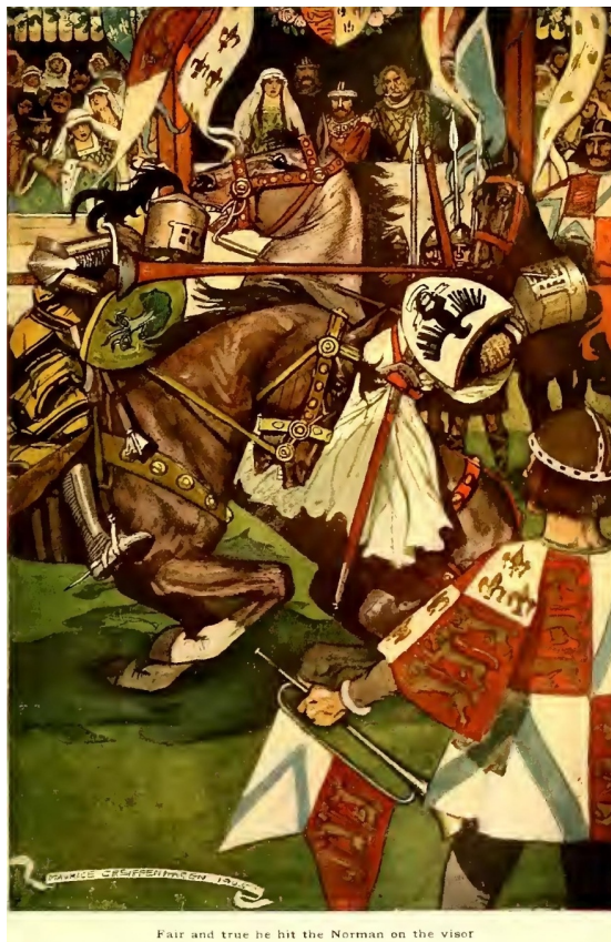
Fair and true he hit the Norman on the visor

To extricate himself from the stirrups and fallen steed, was to the Templar scarce the work of a moment; and, stung with madness, both at his disgrace and at the acclamations with which it was hailed by the spectators, he drew his sword and waved it in defiance of his conqueror. The Disinherited Knight sprang from his steed, and also unsheathed his sword. The marshals of the field, however, spurred their horses between them, and reminded them, that the laws of the tournament did not, on the present occasion, permit this species of encounter.