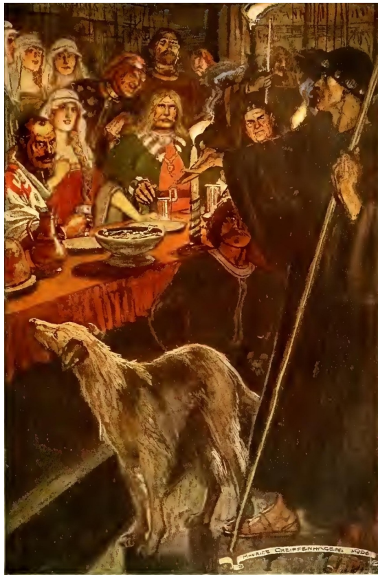
'Second to NONE,' said the Pilgrim, who stood near enough to hear.

"Second to NONE," said the Pilgrim, who had stood near enough to hear, and had listened to this conversation with marked impatience. All turned toward the spot from whence this unexpected asseveration was heard.