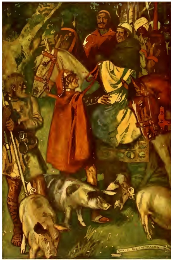
'Your reverences must hold on this path till you come to a sunken cross.'

Now fitted the halter, now traversed the cart, And often took leave,—but seemed loath to depart! 1 —Prior.