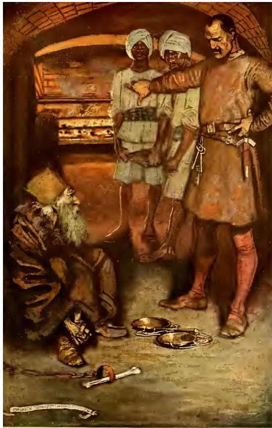
'Seest thou, Isaac,' said Front-de-Bœuf, 'the range of iron bars above that glowing charcoal?'

"Seest thou, Isaac," said Front-de-Bœuf, "the range of iron bars above the glowing charcoal?— 28 on that warm couch thou shalt lie, stripped of thy clothes as if thou wert to rest on a bed of down. One of these slaves shall maintain the fire beneath thee, while the other shall anoint thy wretched limbs with oil, lest the roast should burn.—Now, choose betwixt such a scorching bed and the payment of a thousand pounds of silver; for, by the head of my father, thou hast no other option."