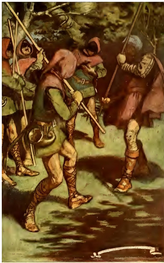
'Come on, churi, an thou darest; thou shalt feel the strength of a miller's thumb!'

"If thou be'st a miller," answered Gurth, undauntedly, making his weapon play around his head with equal dexterity, "thou art doubly a thief, and I, as a true man, bid thee defiance."