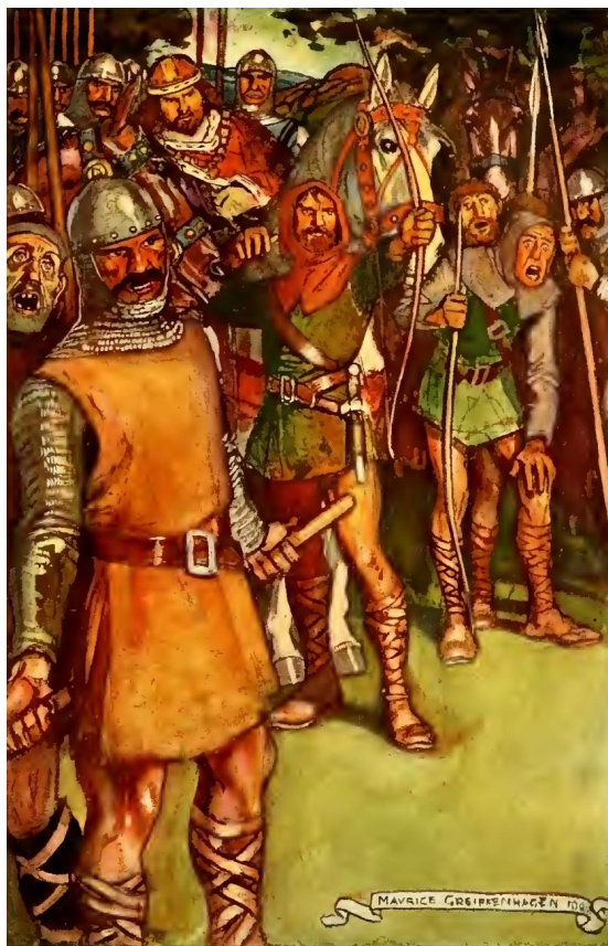
Locksley stepped to the appointed station and shot his arrow.

So saying, and without showing the least anxiety to pause upon his aim, Locksley stepped to the appointed station, and shot his arrow as carelessly in appearance as if he had not even looked at the mark. He was speaking almost at the instant that the shaft left the bowstring, yet it alighted in the target two inches nearer to the white spot which marked the centre than that of Hubert.