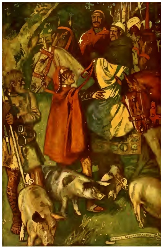
'Your reverences must hold on this path till you come to a sunken cross.'

The Abbot thanked his sage adviser; and the cavalcade, setting spurs to their horses, rode on as men do who wish to reach their inn before the bursting of a night-storm. As their horses' hoofs died away, Gurth said to his companion, "If they follow thy wise direction, the reverend fathers will hardly reach Rotherwood this night."