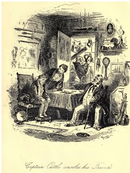
Captain Cuttle consoles his Friends

"Yes, yes—oh yes—I've got some," returned old Sol, first putting his hands into his empty pockets, and then squeezing his Welsh wig between them, as if he thought he might wring some gold out of it; "but I—the little I have got, isn't convertible, Ned; it can't be got at. I have been trying to do something with it for Wally, and I'm old fashioned, and behind the time. It's here and there, and—and, in short, it's as good as nowhere," said the old man, looking in bewilderment about him.