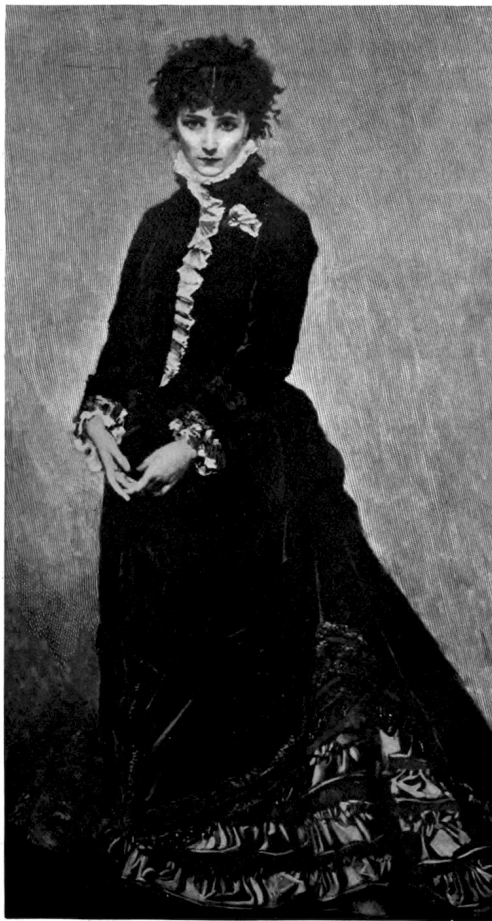
SARAH BERNHARDT From the portrait in the Théâtre Français