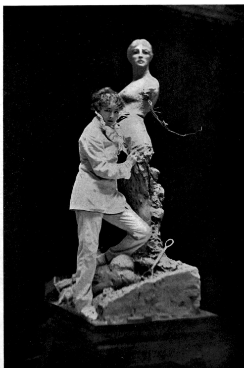
SARAH BERNHARDT AT WORK ON HER MÉDÉE

I would not take anything away with me from the Odéon. I left the furniture of my dressing-room to a young artiste. I left my costumes, all the little toilette knick-knacks—I divided them and gave them away. I felt that my life of hopes and dreams was to cease there. I felt that the ground was now ready for the fruition of all the dreams, but that the struggle with life was about to commence, and I divined rightly.