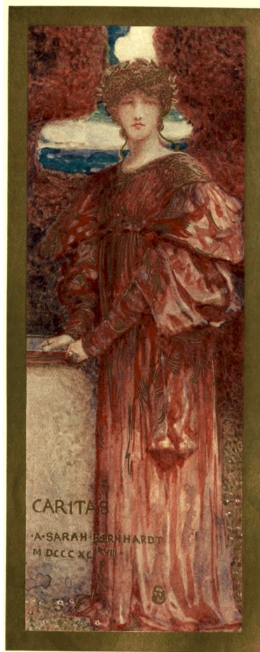
SARAH BERNHARDT IN A FANCY COSTUME