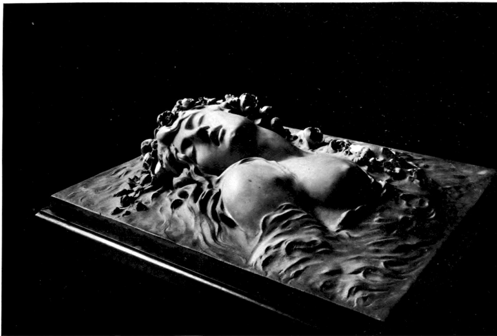
"OPHELIA," SCULPTURE BY SARAH BERNHARDT

My little exhibition was a great success, but I never thought that it was to be the cause of so much gossip and of so many cowardly side-thrusts, until finally it led to my rupture with the Com edie Fran aise.