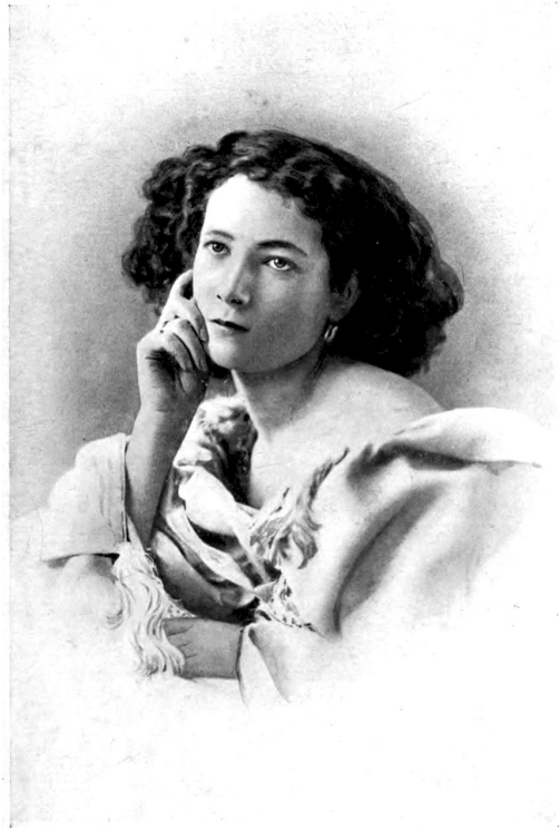
SARAH BERNHARDT ON LEAVING THE CONSERVATOIRE

"She must have some fresh air," he said. "I will treat you to a landau."