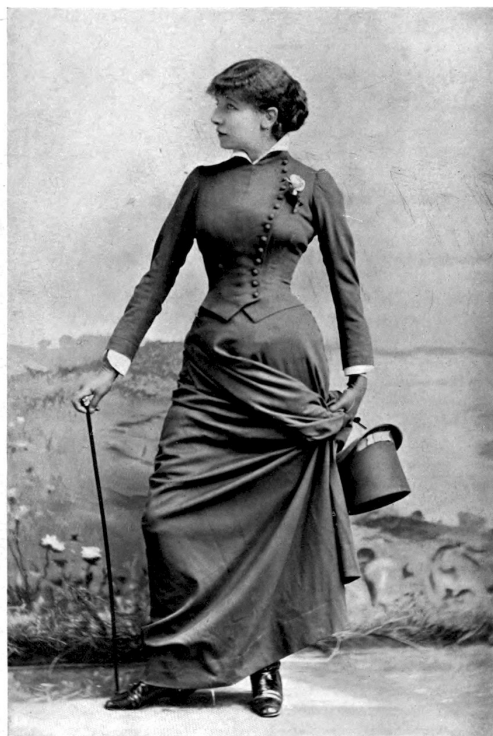
SARAH BERNHARDT IN RIDING COSTUME