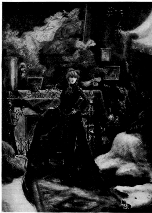
SARAH BERNHARDT AT HOME

After having fixed the price I engaged her for three months. At the idea of earning so much money for three months the poor woman began to cry, and I felt so sorry for her that I told her she would not have to seek for work that winter, because she had already told me that she generally spent six months of the year in the country, in Sologne, near her grandchildren. 277