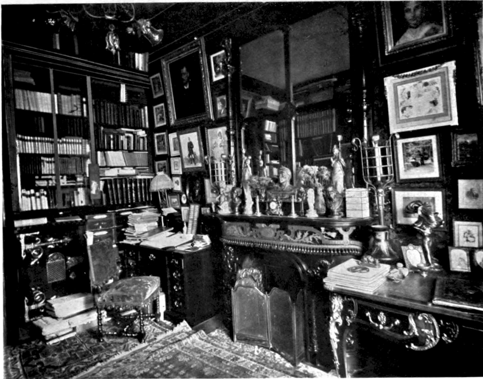
A CORNER OF THE LIBRARY

"Yes, I know the rôle of Phèdre. But I think if ever I had to play it I should die of fright."