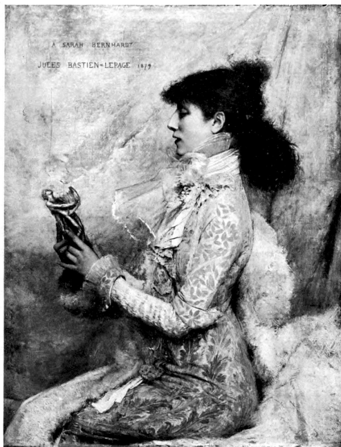
SARAH BERNHARDT From the portrait by Jules Bastien-Lepage

On the first night of Louis Bouilhet's piece, Mademoiselle Aïssé , at the Odéon, Flaubert, who was an intimate friend of the author, introduced an attaché of the British Embassy to me.