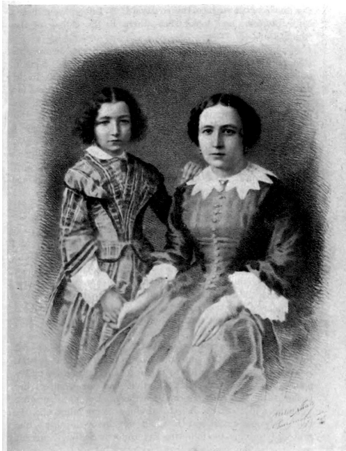
SARAH BERNHARDT AND HER MOTHER