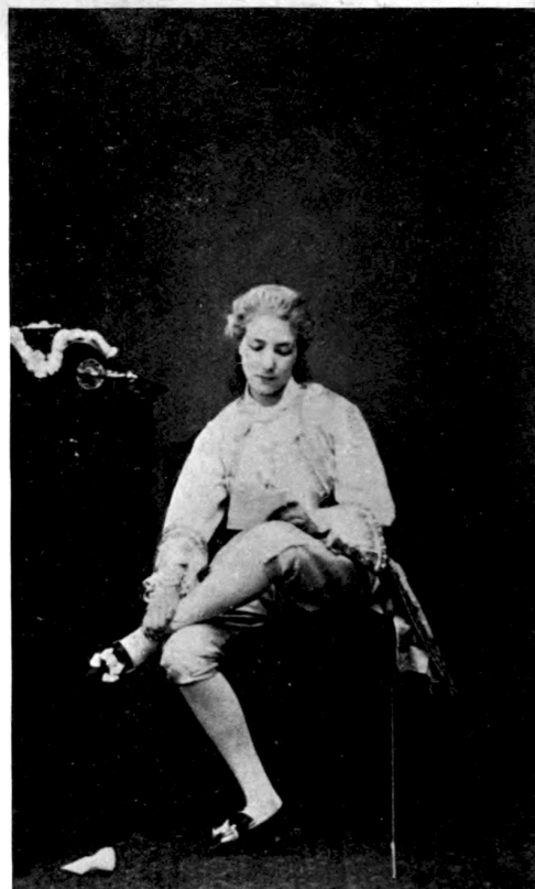
SARAH BERNHARDT AS THE DUC DE RICHELIEU