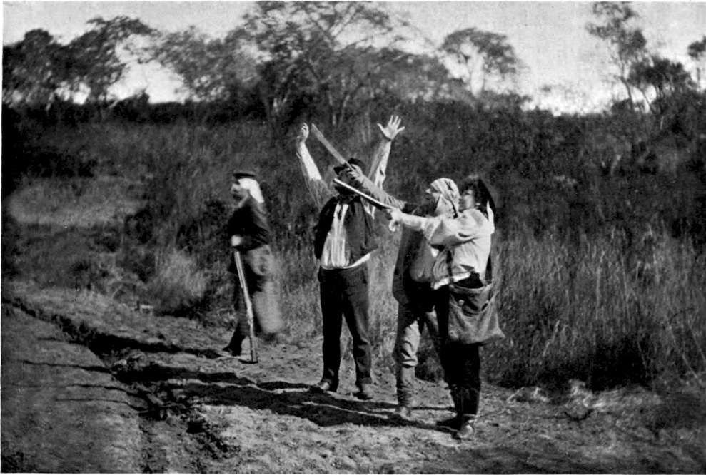
SARAH BERNHARDT AND MEMBERS OF HER COMPANY OUT SHOOTING

On arrival we saw hundreds of pigs hurrying, bunched together, grunting and snorting, along a small narrow raised bridge.