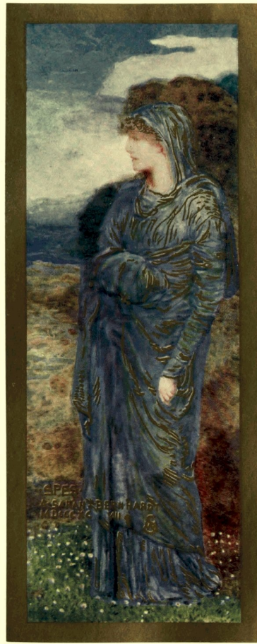
SARAH BERNHARDT AS “ANDROMAQUE”