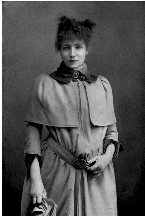
SARAH BERNHARDT IN TRAVELLING COSTUME (1880)

Then I set out for Copenhagen, where I was to give five performances at the Theatre Royal.