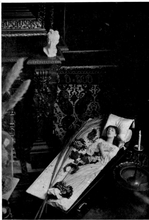
SARAH BERNHARDT IN HER COFFIN