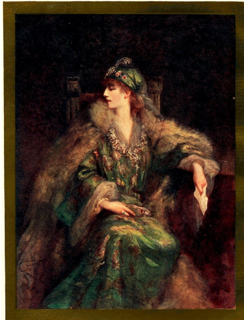
SARAH BERNHARDT AS "ADRIENNE LECOUVREUR"

LONDON: WILLIAM HEINEMANN 21 Bedford Street, W.C.