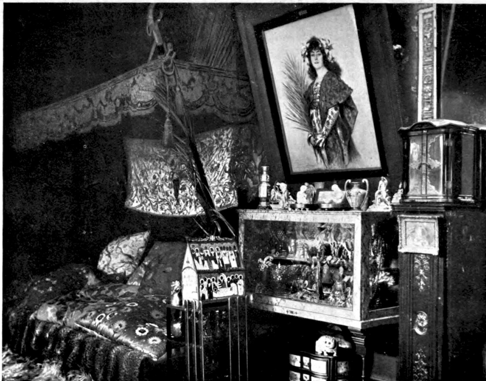
A CORNER OF THE HALL WITH A PAINTING BY CHARTRAN OF SARAH BERNHARDT AS GISMONDA

All the royal personages and the notabilities who were the guests of France during the Exhibition of 1878 came to see me. This was a constant source of pleasure to me.