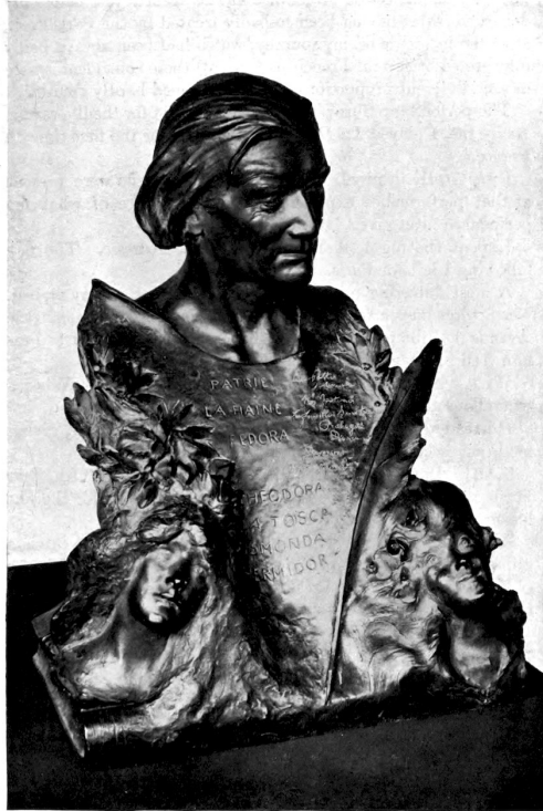
BUST OF VICTORIEN SARDOU BY SARAH BERNHARDT

I conclude the first volume of my souvenirs here, for this is really the first halting-place of my life, the real starting-point of my physical and moral being.