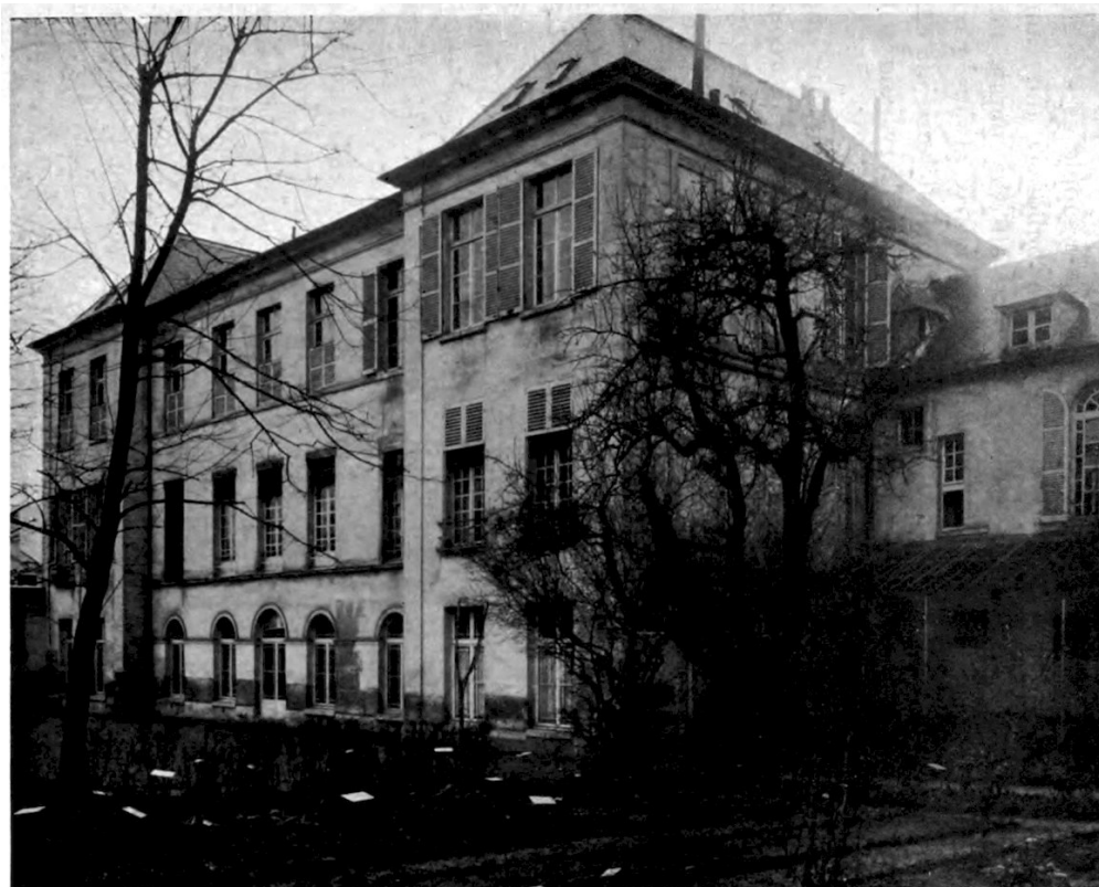
THE GRAND CHAMP CONVENT, FROM THE GARDEN