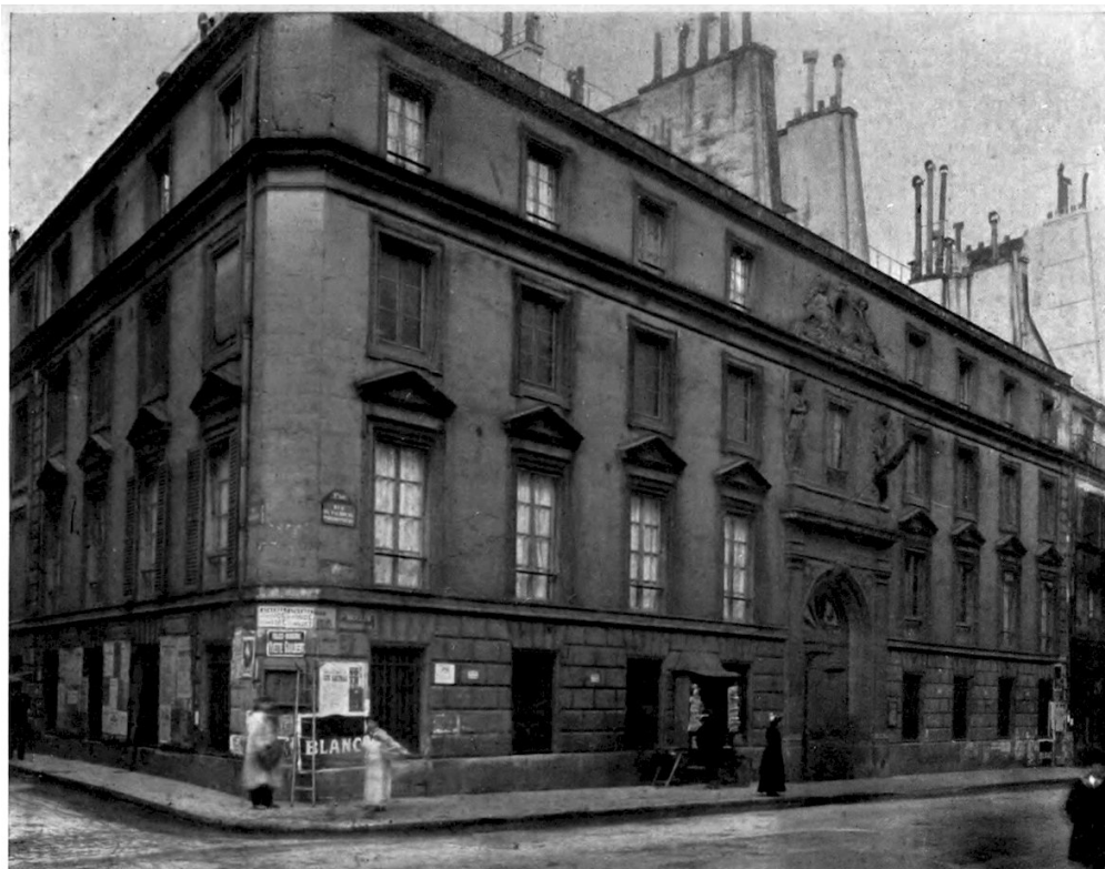
LE CONSERVATOIRE NATIONAL DE MUSIQUE ET DE DECLAMATION, PARIS