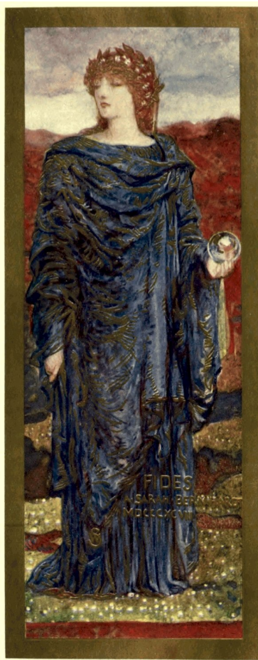
SARAH BERNHARDT AT A FANCY-DRESS BALL