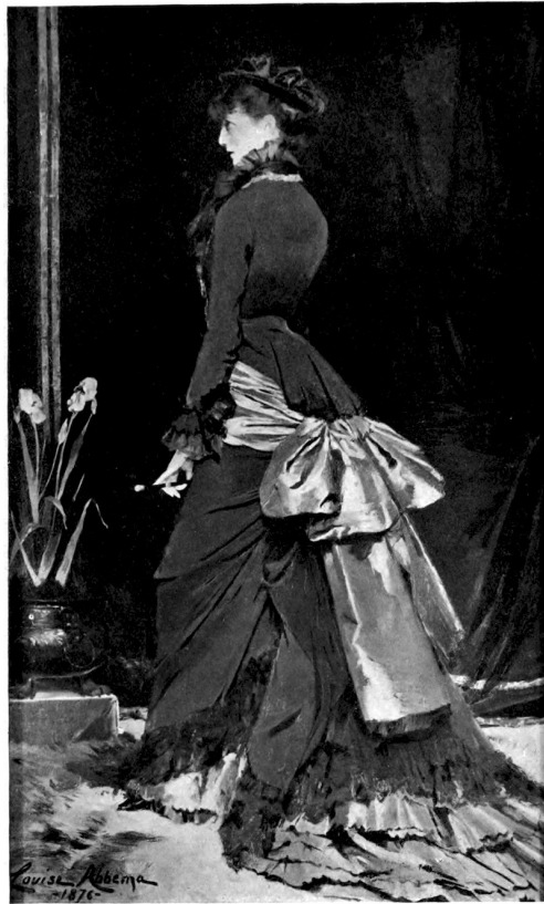
SARAH BERNHARDT From the portrait by Mlle. Louise Abbema

One day I was complaining of this to Madeleine Brohan, whom I loved dearly. That adorable artiste took my face in her hands, and looking into my eyes, said: