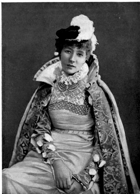
SARAH BERNHARDT AS DONA SOL IN HERNANI

Then came a cry of indignation against me. Why did I want to do anything else but act, since that was my career? Why did I always want to be before the public?