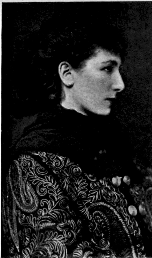
AN EARLY PORTRAIT OF SARAH BERNHARDT

L'Opinion Nationale , September 12: "The same evening Les Femmes Savantes was given. This was Mlle. Bernhardt's third début , and she assumed the rôle of Henriette. She was just as pretty and insignificant in this as in that of Junie [he had made a mistake, as it was Iphigénie I had played] and of Valérie, both of which rôles had been entrusted to her previously. This performance was a very poor affair, and gives rise to reflections by no means gay. That Mlle. Bernhardt should be insignificant does not much matter. She is a débutante , and among the number presented to us it is only natural that some should be failures. The pitiful part is, though, that the comedians playing with her were not much better than she was, and they are Sociétaires of the Théâtre Français. All that they had more than their young comrade was a greater familiarity with the boards. They are just as Mlle. Bernhardt may be in twenty years' time, if she stays at the Comédie Française."