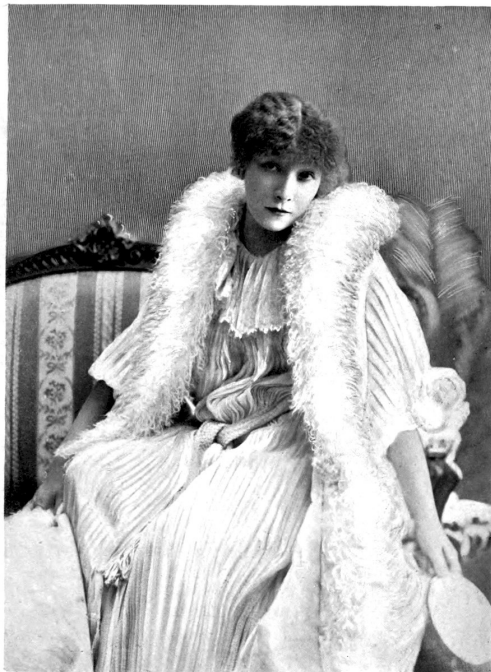
SARAH BERNHARDT (1879)