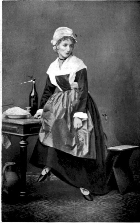
SARAH BERNHARDT IN FRANÇOIS LE CHAMPI

most romantic affection, for had she not been the heroine of a fine love romance!