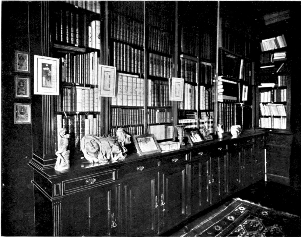
LIBRARY IN SARAH BERNHARDT'S HOUSE, PARIS

“So much the worse for the public! It only proves that the public is idiotic to make a success of such vileness!” And he disappeared without having even entered my dressing-room.