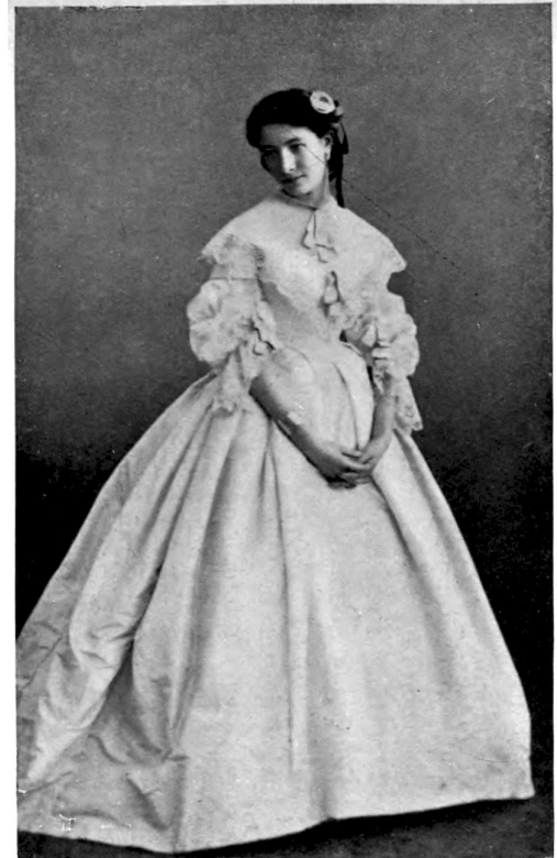
SARAH BERNHARDT IN LES FEMMES SAVANTES