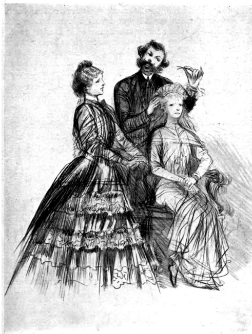
SARAH BERNHARDT IN THE HANDS OF HER COIFFEUR, BEFORE GOING TO THE CONSERVATOIRE EXAMINATION. HER MOTHER IS ON THE LEFT