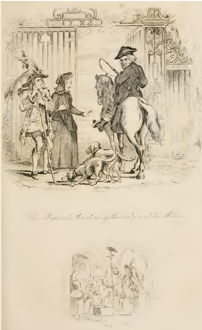
The Shepherd, the Son of Barnaby, and his Mother.