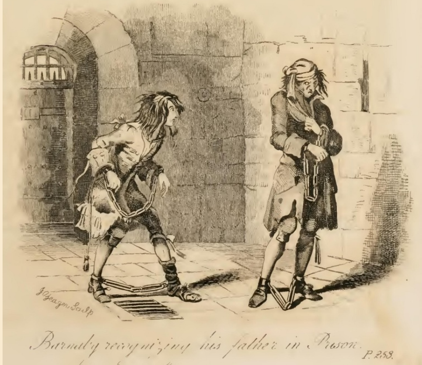
Barnaby recognizing his father in Prison. P. 258.