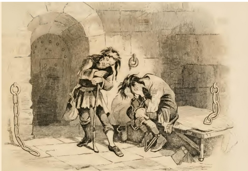
The Blind Man's interview with Barnaby's father in Prison. P. 256