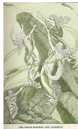
THE RHINE-MAIDENS AND ALBERICH