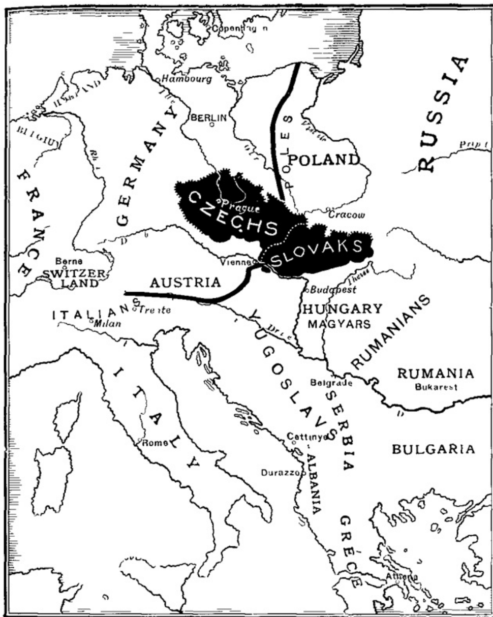
[Illustration: The International Position Of The Czecho Slovak Republic In Future Europe]