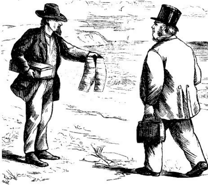
BY THE SAD SEA WAVES. "WANT A NICE PAIR OF BATHING DRAWERS, BOSS?"

"The Printing House of the United States."