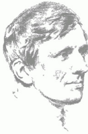
JOHN HENRY NEWMAN.