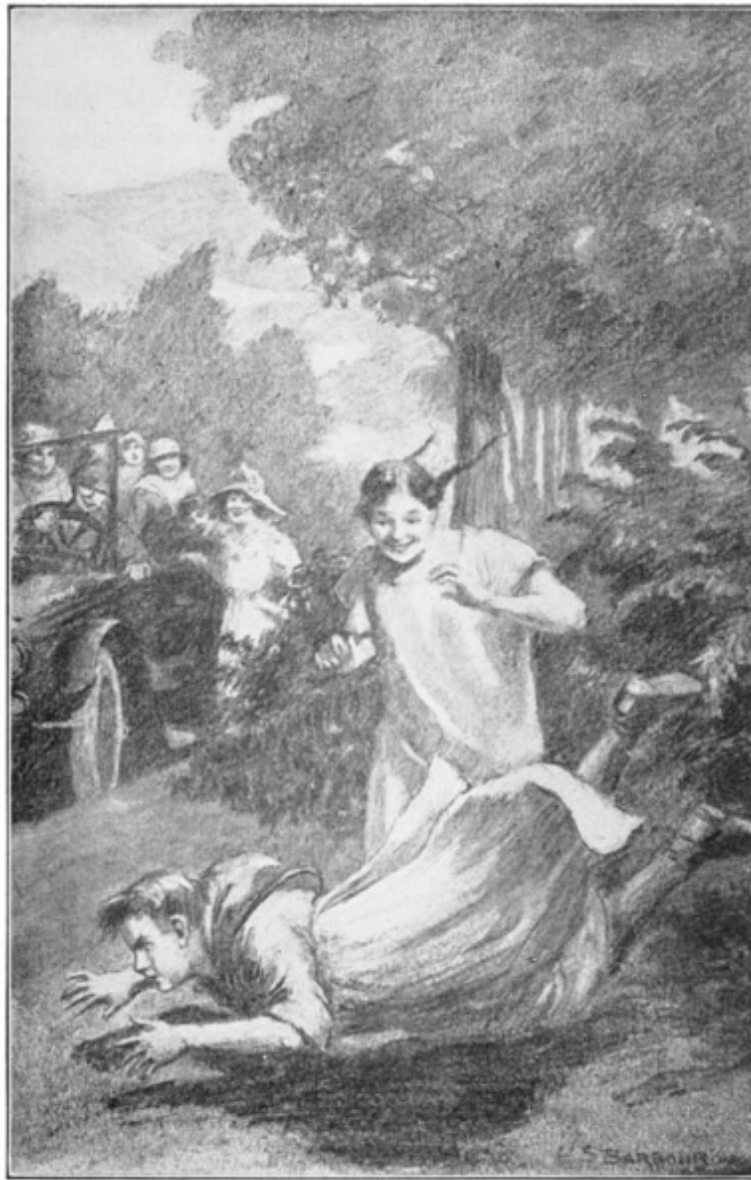
PEE-WEE TRIPPED ON HIS APRON AND WENT SPRAWLING.

"Hot frankfurters," shouted Pee-wee from behind his counter. "They're all hot! Here you are! Get your fresh sweet cider! Five a glass! Doughnuts six for a dime! All fresh!"