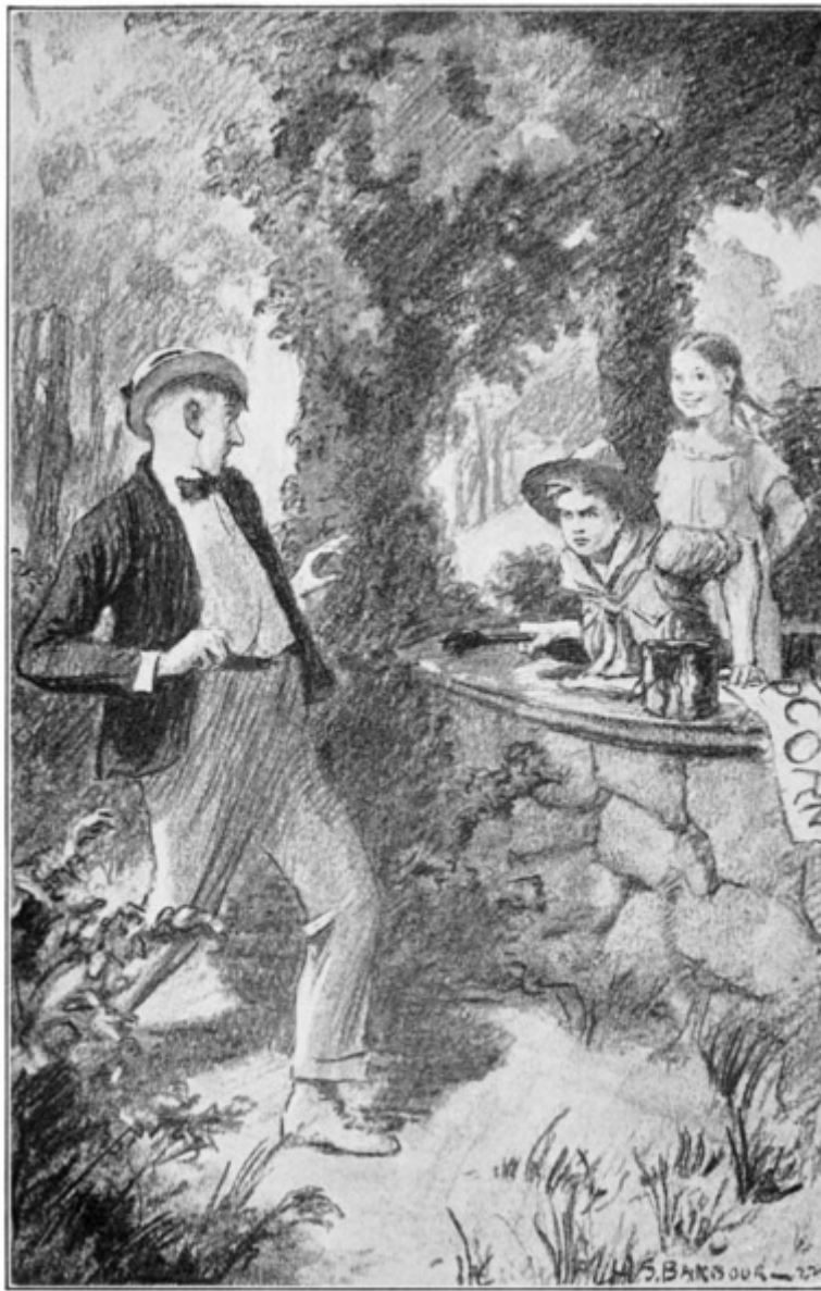
MR. GAMELY DECIDES TO KEEP AWAY FROM PEE-WEE'S BRUSH.

Deadwood Gamely broke into a very excessive but false laugh. "No harm intended," he said, vaulting on to the fence and sitting discreetly at that distance. "What's all this going on here? Going to have a circus or play store or something?"