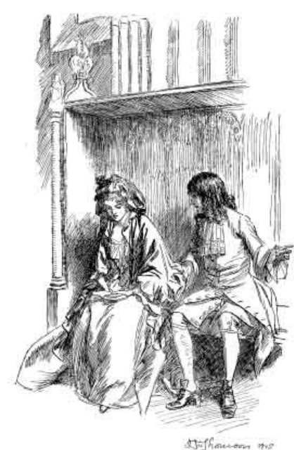
LADY CASTLEWOOD AND HER SON.